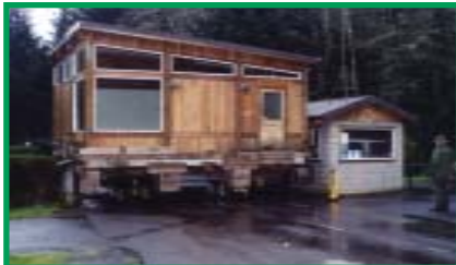
Tight fit at Sunset Campground