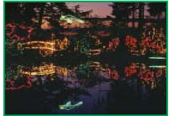
Leaping frog drew rave reviews!