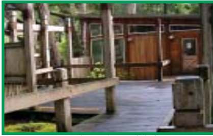
Former Information & Gift Center