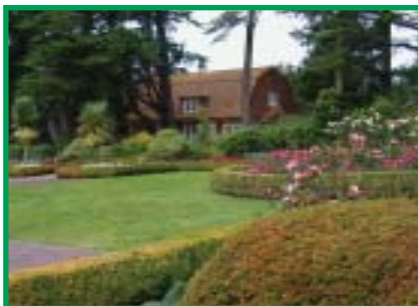
New IGC Taking Shape

See more pictures on our web site: www.shoreacres.net