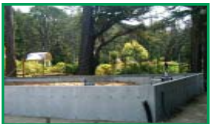
New IGC Foundation