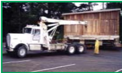
Moving to Sunset Campground