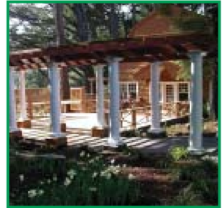
Information & Gift Center March 2004

For more information about Friends of Shore Acres Inc. and Shore Acres State Park, visit our web site at www.shoreacres.net