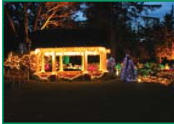
Pavilion at dusk. Notice the uplighting on huge trees. Look for more landscape lighting in 2005 as we continue "framing" the garden.

A.B.A.T.E. of Oregon AM-VETS Post #10 and Auxiliary Bay Area Optimist Club Bay Eye Clinic Bay Area Bonsai Society Bay Area Hospital Boy Scouts - Troop #156 Chinook District Boy Scouts Coos Bay Fire & Rescue Coos Bay-North Bend Rotary Club Coos Bay Yacht Club Coos County Extension Service Coquille Friends Coquille High School Key Club and Kiwanis Harley Owners Group Hauser Dune Riders Life Care Center of Coos Bay Marshfield Class of '40 & Friends Marshfield High School Students Menasha Forest Products Corporation Mid-Coast Mustang & Ford Club Miss Coos County Scholarship Pageant North Bend Education Association North Bend Medical Center Oncology Dept. North Bend United Methodist Church O.M.I.(Operations Management International) Occidental Chapter #45, Order of Eastern Star Oregon South Coast Single Friends Prudential Seaboard Properties Red Lion Hotel - Care Committee Sea Breeze Harmony of Sweet Adelines Soroptimist International of the Coos Bay Area South Coast Cruisers Car Club South Coast Orthopaedic Associates South Slough National Estuarine Research Reserve Southwestern Oregon Community Action Southwestern Oregon Rose Society Southwestern Oregon Street Rods St. Monica Parrish Sterling Savings Bank Sunset Classic Chevys The Bay Area Rotary Club The Gorse Society Umpqua Discovery Center Washington Mutual Wineva Johnson Center Xi Gamma Omega Zonta Club of the Coos Bay Area