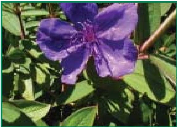
Silky and shiny purple Princess Flower

Princess Flower (alias Tibouchina urvilliana ) is something quite different—a medium to tall shrub (rudbeckia is an herbaceous perennial) with blooms that combine rich purple color and a silky texture and shine.