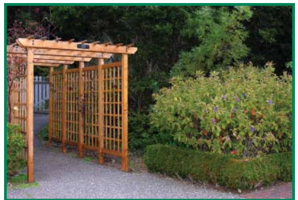
Rose pergola and Princess flower behind hedge.

Since it is relatively easy to propagate from cuttings, has long lasting beautiful flowers, and is tolerant of our growing conditions, it’s interesting that more people around here aren’t growing the princess flower. Luckily, some local nurseries are growing and selling the plant so if anybody is looking for a plant that will grace their gardens in purple splendor (while making the neighbors green with envy) plant a tibouchina and while you’re at it plant a few rudbeckias. ~