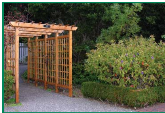
Rose pergola and Princess flower behind hedge.

Since it is relatively easy to propagate from cuttings, has long lasting beautiful flowers, and is tolerant of our growing conditions, it’s interesting that more people around here aren’t growing the princess flower. Luckily, some local nurseries are growing and selling the plant so if anybody is looking for a plant that will grace their gardens in purple splendor (while making the neighbors green with envy) plant a tibouchina and while you’re at it plant a few rudbeckias. ~