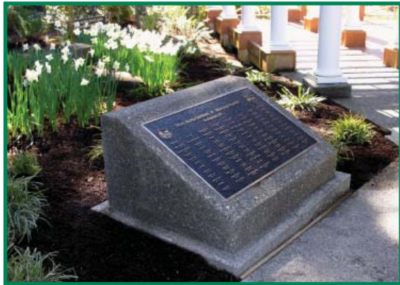
New memorial display at the left side of entrance.