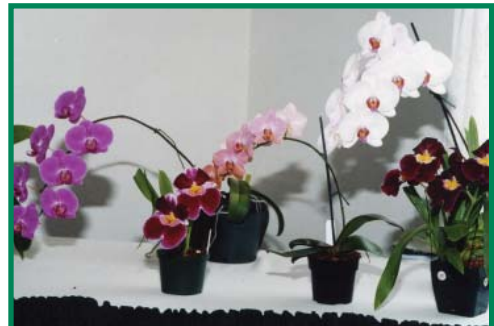
Orchids “Gems of the Rain Forest”

Oregon Coast Music Festival GARDEN CONCERT Featuring SAMBA JA Saturday, July 23 * 12:30 PM