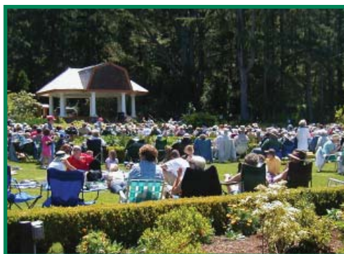
Always a big crowd at the Oregon Coast Music Festival Garden Concert in July.

Another chance to volunteer! Friends’ volunteers help park staff park cars in the large field outside the gardens. Friends’ volunteers sell fresh raspberry and chocolate sundaes and ice cold lemonade. Join the fun!