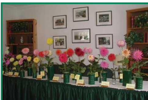
Dazzling Dahlias in the Garden House

D uring the year, the Friends of Shore Acres sponsor “flower days” when the garden house is open from 11 AM to 4 PM with volunteers serving punch, cookies and coffee.