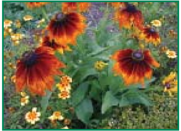
Velvety gold and mahogany Rudbeckia - “Cherokee Sunset”

A good garden plant is more than just having a showy flower. For example, there are more than a few plants that we have tried at various times whose gorgeous blooms popped out/stopped blooming early in the season and left embarrassing empty spaces in our color spots. Cherokee Sunset has the ability to start blooming by late June and continue on in good form throughout the summer and fall—into October or November or later. In fact as I write this in late January, there are still a few flowers trying to bloom. Moreover, this variety is very tolerant of the cool summer temperatures, wind, salty sea fogs, and the less than perfect soils that pretty well typify the “normal” growing conditions here. All in all, a standout garden plant that successfully combines beauty, reliability, and just plain gorgeous gumption; amply justifying all the favorable comments and questions received from so many park visitors on this special plant—all the other plants are jealous!