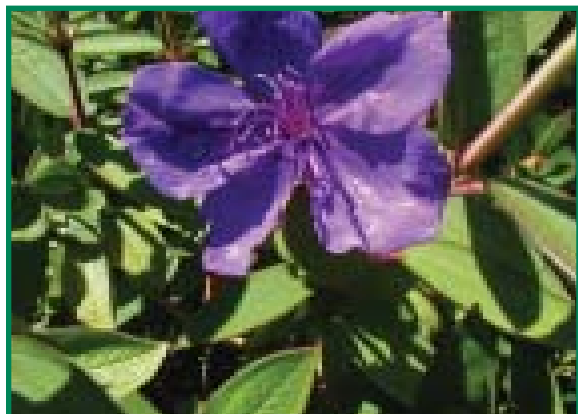
Silky and shiny purple Princess Flower

Princess Flower (alias Tibouchina urvilliana ) is something quite different—a medium to tall shrub (rudbeckia is an herbaceous perennial) with blooms that combine rich purple color and a silky texture and shine.