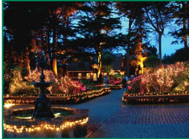
Dusk is the favorite time for many who visit.