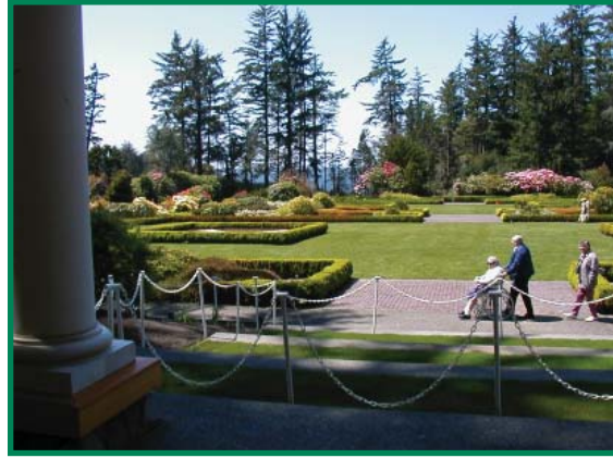
Shore Acres Gardens - All Abilities Accessible