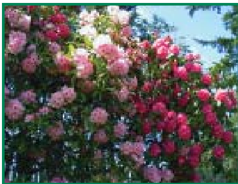
Regal rhododendrons on the west side.