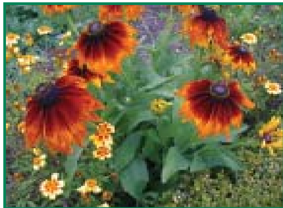
Velvety gold and mahogany Rudbeckia - “Cherokee Sunset”

A good garden plant is more than just having a showy flower. For example, there are more than a few plants that we have tried at various times whose gorgeous blooms pooped out/stopped blooming early in the season and left embarrassing empty spaces in our color spots. Cherokee Sunset has the ability to start blooming by late June and continue on in good form throughout the summer and fall—into October or November or later. In fact as I write this in late January, there are still a few flowers trying to bloom. Moreover, this variety is very tolerant of the cool summer temperatures, wind, salty sea fogs, and the less than perfect soils that pretty well typify the “normal” growing conditions here. All in all, a standout garden plant that successfully combines beauty, reliability, and just plain gorgeous gumption; amply justifying all the favorable comments and questions received from so many park visitors on this special plant—all the other plants are jealous!