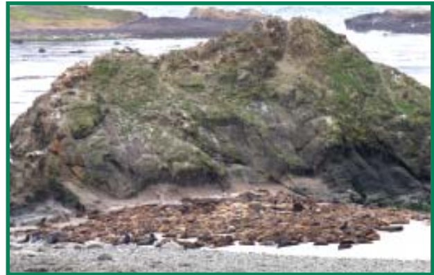
Shell Island at Simpson Reef