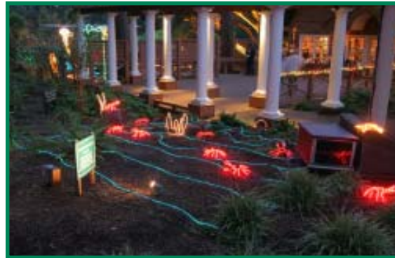
Scurrying crabs and blue and white waves.

It was the students' opportunity to demonstrate how they had mastered the concepts and skills covered in the class. One of the conditions of this exam was that the class instructor would serve only in the roles of consultant and unskilled labor. The project would succeed or fail dependent on the students themselves. The class successfully rose to the occasion and other classes and departments at the college graciously offered their services and expertise and joined what became a multi-departmental design and construction team.