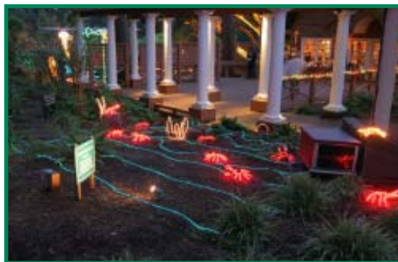
Scurrying crabs and blue and white waves.

It was the students' opportunity to demonstrate how they had mastered the concepts and skills covered in the class. One of the conditions of this exam was that the class instructor would serve only in the roles of consultant and unskilled labor. The project would succeed or fail dependent on the students themselves. The class successfully rose to the occasion and other classes and departments at the college graciously offered their services and expertise and joined what became a multi-departmental design and construction team.