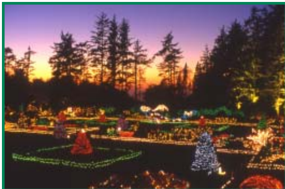
New large landscape lights on west side trees.