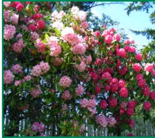
Shore Acres Gardens - Springtime Rhododendrons