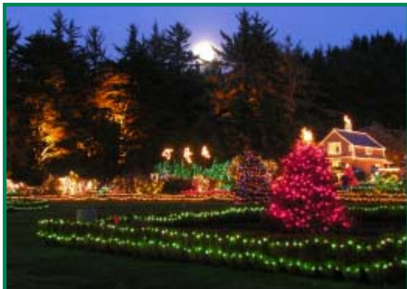
Brilliant L.E.D. lights illuminate large Christmas trees.