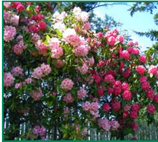
Shore Acres Gardens - Springtime Rhododendrons