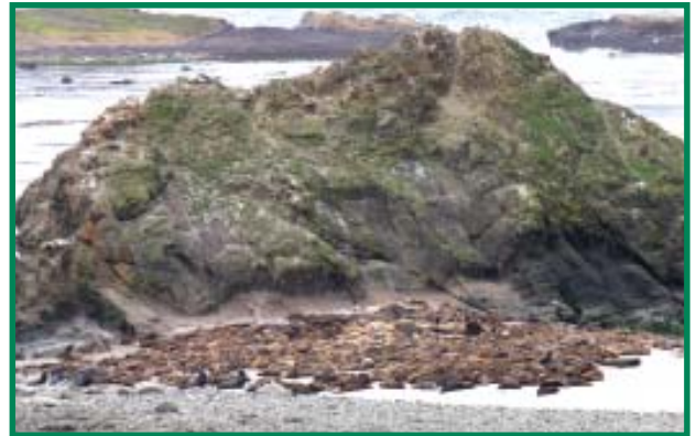
Shell Island at Simpson Reef