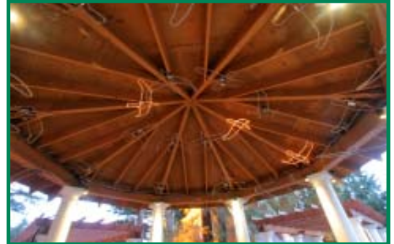
Individually controlled seagulls overhead.

The class decided to design a display with three main elements. The first element, consisting of 28 individually controlled seagulls, would reside under the roof of the main entrance gazebo. By sequentially turning individual birds on or off the birds could be made to appear as if they were flying across the ceiling in up to six different paths. The second element, of 20 red crabs, was placed in the land-scaped area immediately to the left of the main entrance. By sequencing these crabs, it was made to appear that there were four crabs scuttling around in the area. The third and final element was a sequenced line of eight blue and white waves which flowed back and forth around the scurrying crabs. All in all, the class used nearly 1000 feet of variously colored rope lights in the construction of the display. The 40 individual light groups were