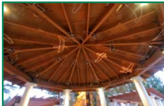
Individually controlled seagulls overhead.

The class decided to design a display with three main elements. The first element, consisting of 28 individually controlled seagulls, would reside under the roof of the main entrance gazebo. By sequentially turning individual birds on or off the birds could be made to appear as if they were flying across the ceiling in up to six different paths. The second element, of 20 red crabs, was placed in the land-scaped area immediately to the left of the main entrance. By sequencing these crabs, it was made to appear that there were four crabs scuttling around in the area. The third and final element was a sequenced line of eight blue and white waves which flowed back and forth around the scurrying crabs. All in all, the class used nearly 1000 feet of variously colored rope lights in the construction of the display. The 40 individual light groups were