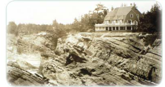
Simpson's first Mansion of the Bluff, circa 1910

1977 - All America Rose Selections Display Garden established.