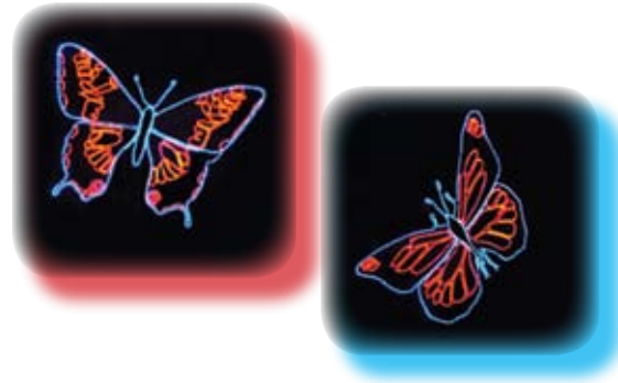
2003-04 Butterflies: Design, Fabrication and Lighting - David Bridgham