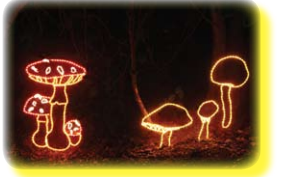
2004 Mushrooms: Design, Fabrication, and Lighting - David Bridgham