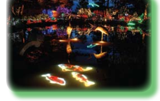
2012 Koi Carp in Pond: Design, Fabrication and Lighting - David Bridgham