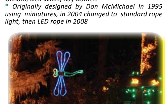
2009 - Dragonfly: Design, Fabrication and Lighting - David Bridgham; Installation - Dell Willis