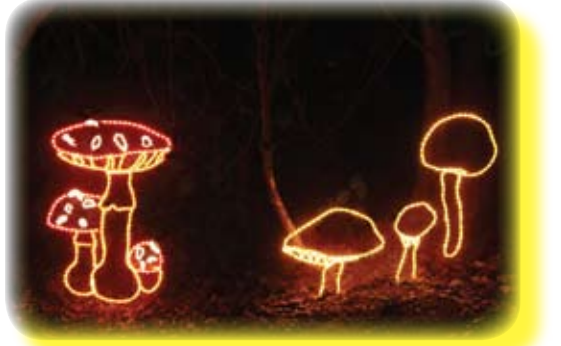
2004 Mushrooms: Design, Fabrication, and Lighting - David Bridgham