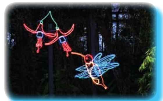
2011 Fuchsia Flower and Hummingbird: Design, Fabrication, Lighting and Animation - David Bridgham