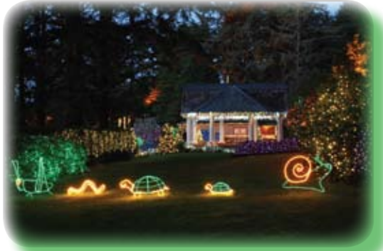
2003 Garden Bugs (Grasshopper, Snail, Worm) and Turtles: Design, Fabrication and Lighting - David Bridgham, Dell Willis