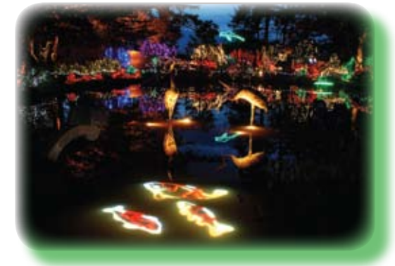
2012 Koi Carp in Pond: Design, Fabrication and Lighting - David Bridgham