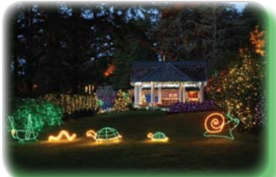
2003 Garden Bugs (Grasshopper, Snail, Worm) and Turtles: Design, Fabrication and Lighting - David Bridgham, Dell Willis