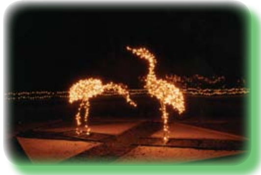
1990 Herons / Cranes: Design, Fabrication and Lighting - David Bridgham and Frank Smith

From miniature lights in 1990 to standard rope lights in 2004 to LED rope lights in 2010