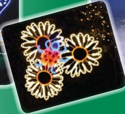
Shore Acres "Wave" in December