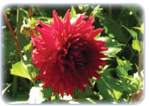
Dahlia "Shore Acres"

It has been another great year, with many thanks to each of our volunteers.