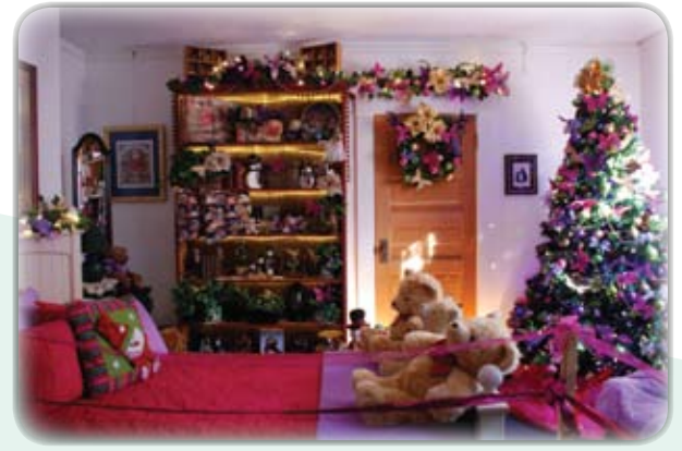
CHILD'S BEDROOM IN THE GARDEN HOUSE

Cities and Towns: 199 Oregon • 126 California • 67 Washington • 162 cities and towns from other states