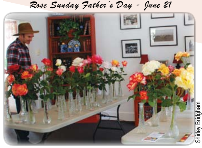
DISPLAY BY THE SOUTHWESTERN OREGON ROSE SOCIETY

Oregon Coast Music Festival Garden Concert - July 18