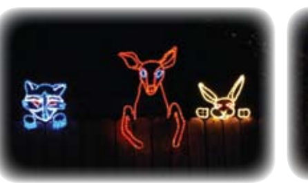
INSPIRED BY ROBYNN REED - A RACCOON, DEER AND RABBIT BEHIND THE PAVILION GATE