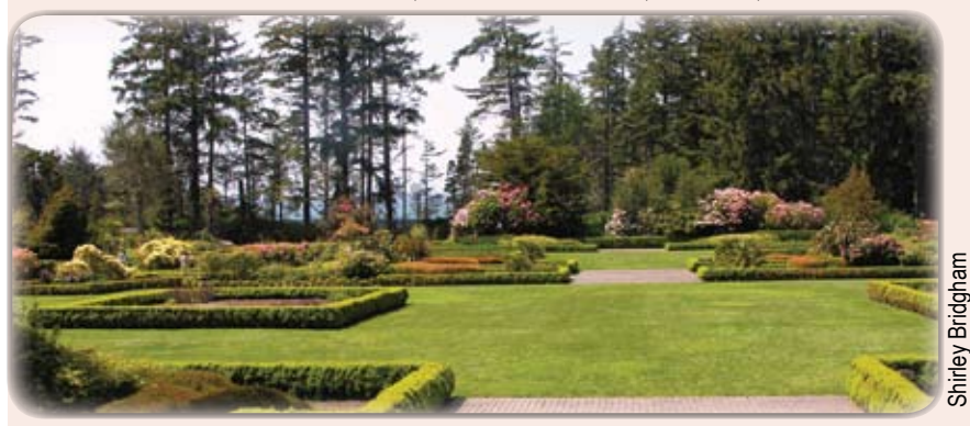
BEAUTIFUL SETTING FOR A DISPLAY AND EXPERTS FROM THE SOUTHWESTERN OREGON CHAPTER OF THE AMERICAN RHODODENDRON SOCIETY

Rhododendron Sunday | Mother's Day - May 10