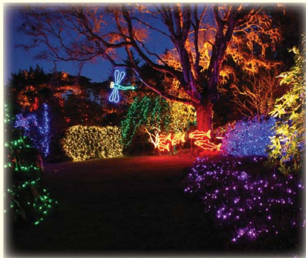
Dragonfly is another favorite sculpture.