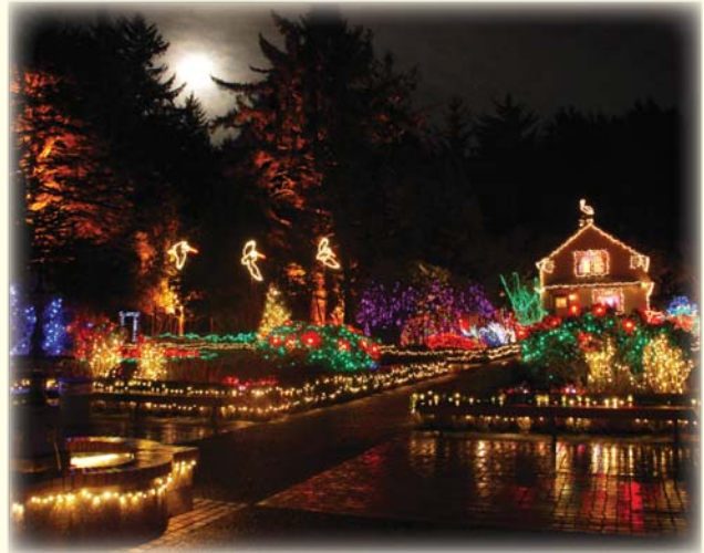
Full moon enhances LED lighting.

Sixes, OR – Wonderful Eye Candy Vacaville, CA & Bandon, OR – We got to be kids again for one night - enchanting! (Gretchen and Bob Ash, B&B winner)