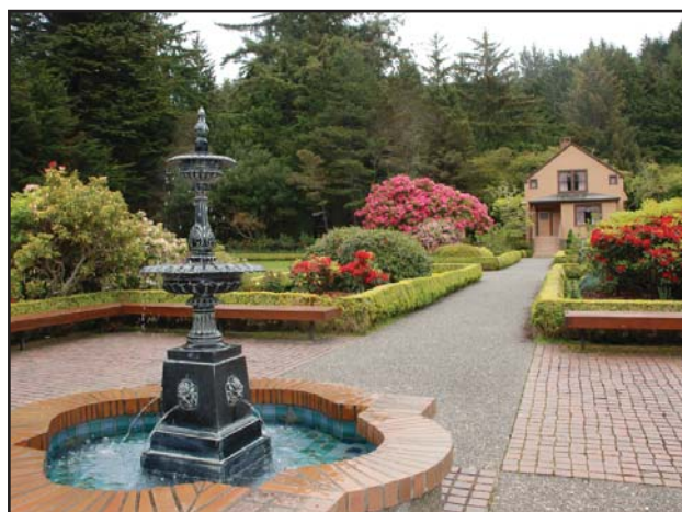
Memorial Fountain - 2010