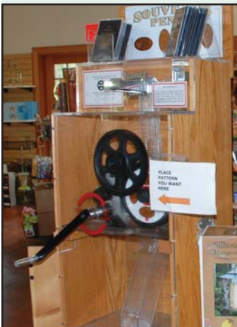
Popular Penny Smasher