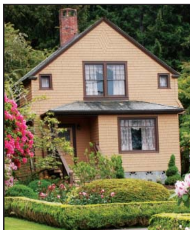
New glass corner windows and beautiful lace curtains.