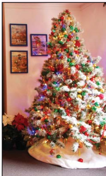
Flocked tree "smothered" in unusual ornaments and lights.

As I take a few minutes to write this, it's spring and I am listening to the "never ending" rain patter on the metal roofing of the building I am in. It is weather very similar to the time of year when I begin my annual creative endeavor at Shore Acres. Decorating the Garden House fullfills my need to take on a huge project with a short time line and a different theme each year to keep our guests inspired (and happy). The Oregon Parks & Recreation Department is always happy to work with us and continues to perform the work needed to keep the Garden House in excellent condition. From windows to paint there seems to be some sort of project each year to keep the Garden House in visitor ready condition. Usually these projects are started after the busy summer season and before the Holiday Lights event—exactly when I am decorating! It always works out with everything completed and decorated before the lights are switched on for the season.