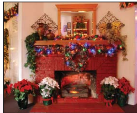
Favorite fireplace for family photos.

Santa in the bathtub is a perennial favorite and I believe people send their little ones under the cording for that annual picture! Santa doesn't seem to mind. The outside view is absolutely stunning and I feel the house is a warm backdrop