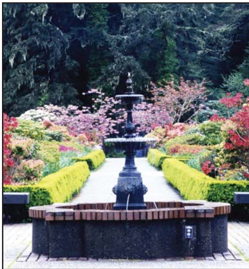
Memorial Fountain - 1996