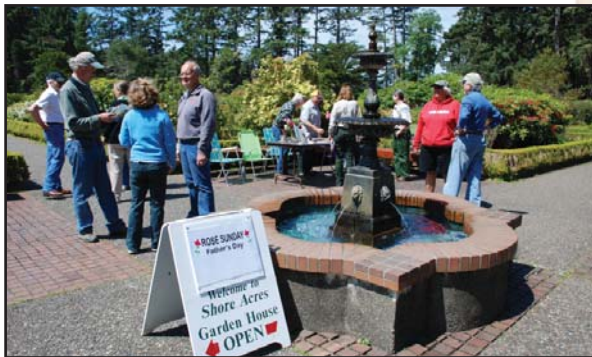
Many visitors on Rose Sunday/Father's Day 2009