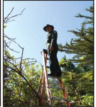
Park Ranger Bob Dixon checked the view from the west side and took a picture of the Pavilion to select a location for the pole and web cam.