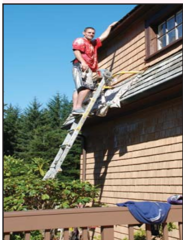
New paint job in 2009.