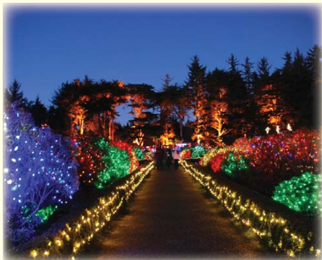
Uplighted giant Monterey cypress frame the LEDs.