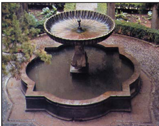
Inspiration for the Shore Acres Memorial Fountain - the Alhambra garden fountain with its 'circle-on-a-square' outline