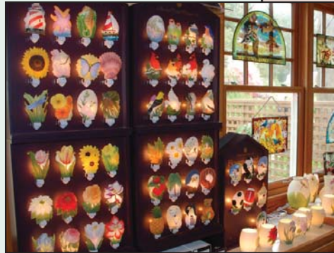
Night Lights Selection Expanded