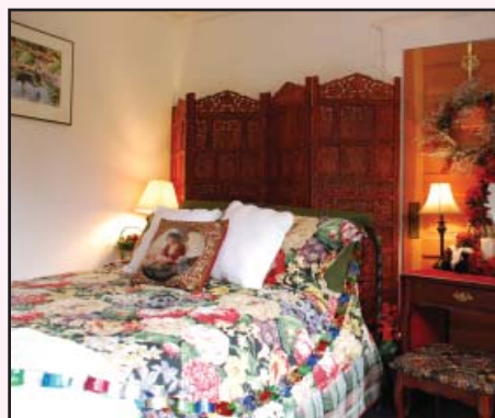
Comfy bed for B&B winners.