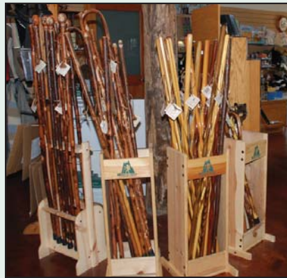
Canes, Walking Sticks and Medallions