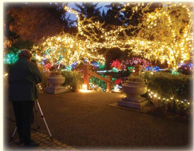
Entrance to the pond - a favorite for photographers.