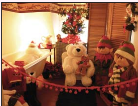
A perennial favorite - Santa and friends.

to that splendor. I have fun visiting with the hardy individuals who work "outside" in the ever changing weather while I stay warm and cozy.