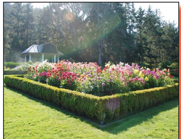
Next Dahlia Day - Sept. 25, 2010