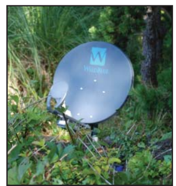
A Pelco camera and Wildblue satellite dish make the web cam possible. We look forward to improving technology.