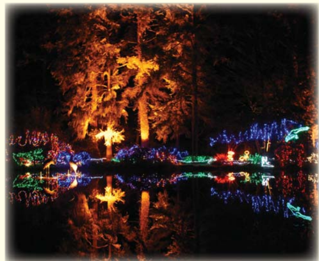
Awesome reflections at the pond.

TO SEE THE DETAILED REPORT, GO TO WWW.SHOREACRES.NET AND CLICK ON “HOLIDAY LIGHTS”