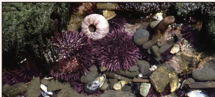
Tidepool Walks offered by Sunset Bay Campground