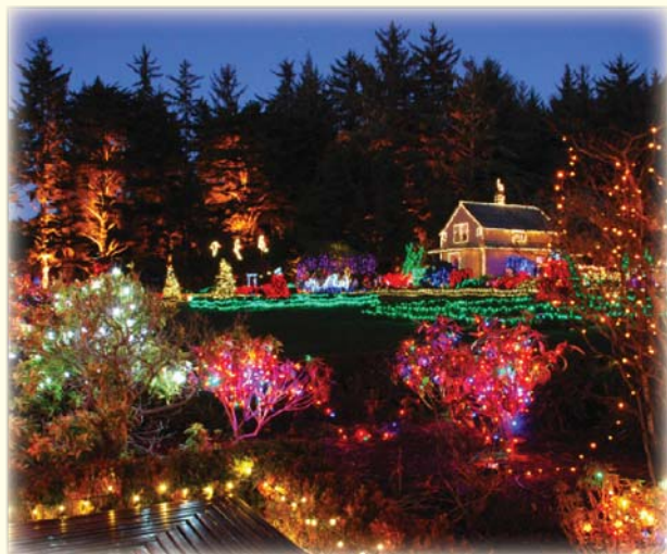
View from Southwest corner of the garden