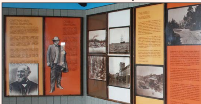
Historical Displays to be redesigned and replaced.