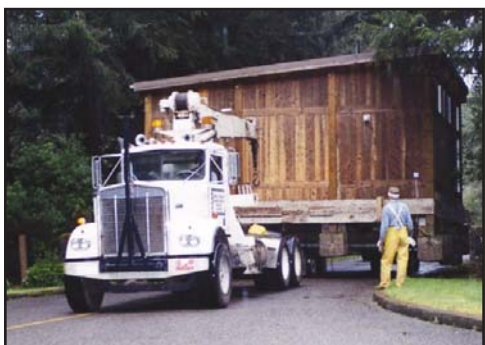
2003 - IGC moved to Sunset Bay Campground for a new interpretive center.

As we promised in the last Journal, we are constantly looking for new and "Green" items. The IGC has now expanded into more products using recycled paper and fibers as well as postcards printed locally featuring photos of Shore Acres State Park that are available ONLY in our Information and Gift Center.