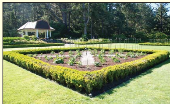
Phase 2 - Square bed hedges have also recovered. Dahlias in June will be dazzling in late summer!