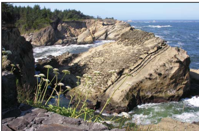
Looking south from the bluff at Shore Acres.

Lookin north from the Observation Building. Besides the historical Shoreacres story, the new panels in the Observation Building also will provide geologic and wildlife interpretation. An interpretive panel also will be located at the entrance to the formal gardens.