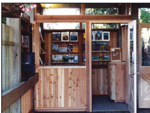
1989 - Information & Gift Center (IGC) (8' x 8')