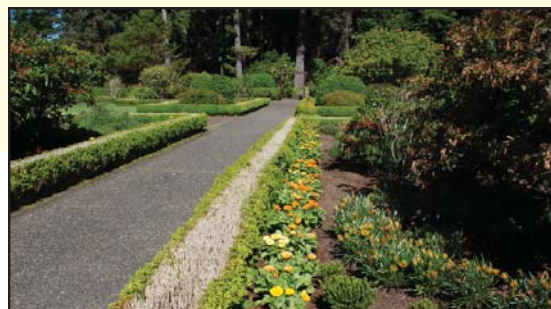
Phase 3 - Formal Garden bed hedges lowered to 19" Annuals will be blooming until Holiday Lights.