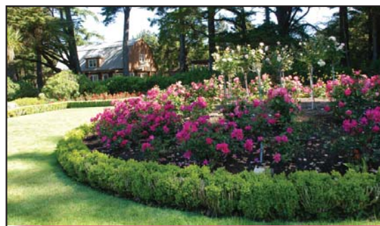
Phase 1 - Circle bed hedges have recovered nicely. Ravishing roses are much easier to see!

Thank you, to each of you, for your unending support. •