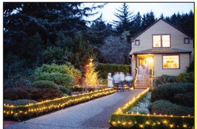
Garden House - 1987 - First Lights display had 6,000 miniature lights and one Christmas tree, but the house was decorated and open with hot cider, punch, coffee and cookies!