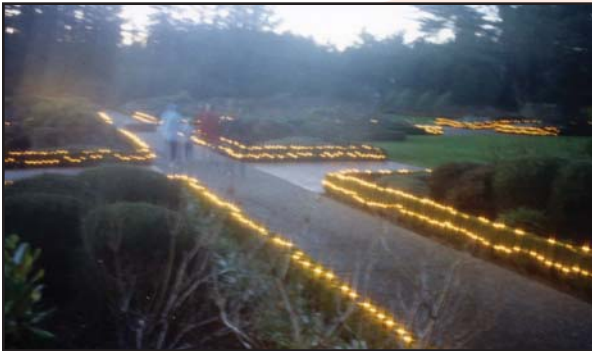
1987- First "Christmas at Shore Acres"