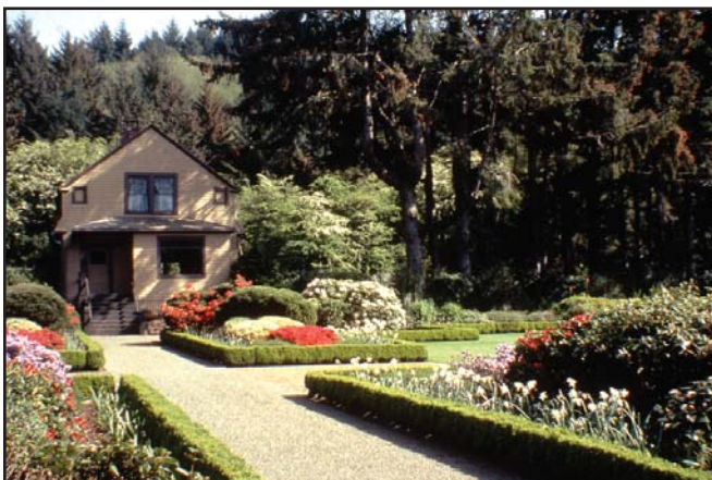
Garden House - 1986 - Photo from The Shore Acres Story , the multi-image slide show that inspired the formation of Friends of Shore Acres, Inc. on Dec. 4, 1986.