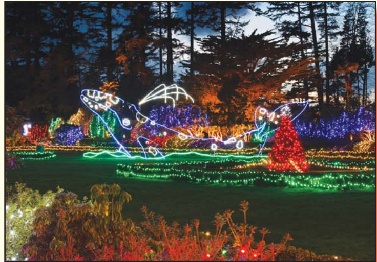
Spouting gray whale is a favorite of many visitors.

216 Oregon; 120 California; 44 Washington; 195 Other