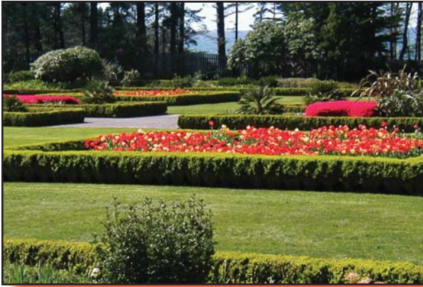
Tulips and Hino crimson azaleas every spring.