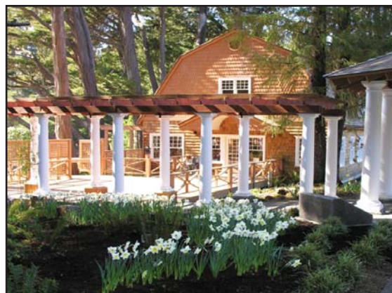
2003 - New Entrance and IGC (32' x 48') reminiscent of L. J. Simpson's first mansion and rose arbor columns

If you just want to stop and ask questions, we have great hosts and volunteers who can provide or find the information you need. •