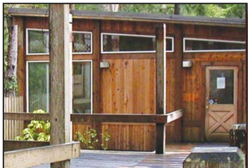
1992 - 2003 - IGC (24' x 24')