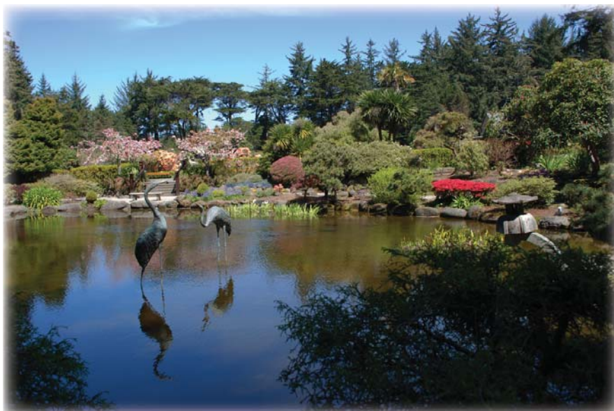
Springtime blossoms and Heron reflections at the Lily Pond