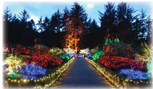
Center path to the Lily Pond and Uplighted Evergreens