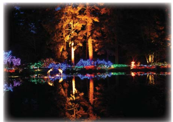
Awesome Pond Reflections