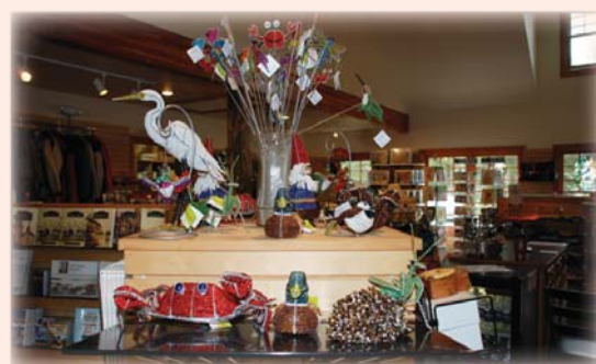
Beadworx by Grass-Roots