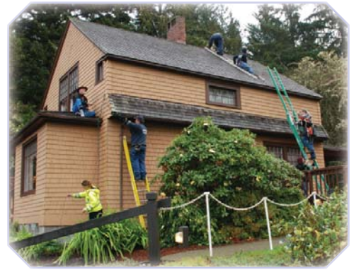
Coos Bay Fire & Rescue volunteers take care of lights on the Garden House with direction from David Bridgman (on porch roof)