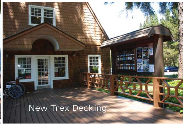
New Trex Decking