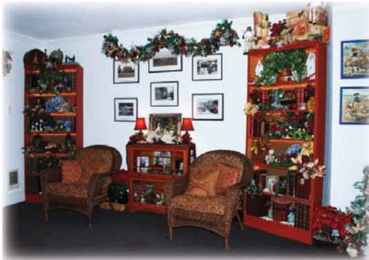
Living room with historical photos.