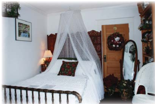
Bed & Breakfast Bedroom