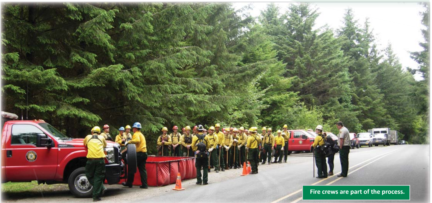
Fire crews are part of the process.