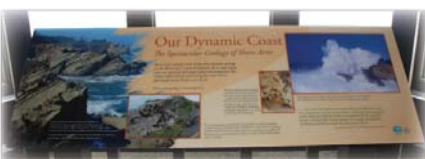
#7 - Our Dynamic Coast - The Spectacular Geology of Shore Acres