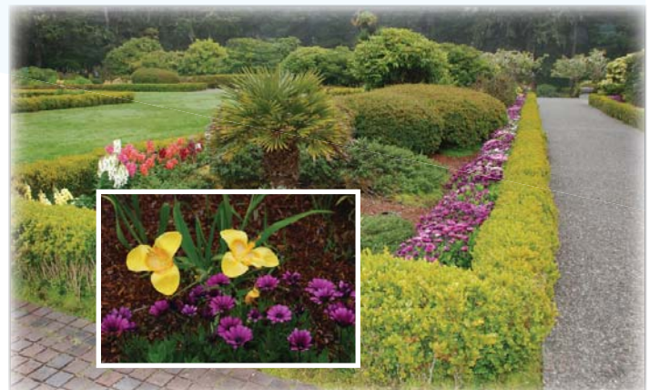
African Daisies - Osteospermum 'Akila' - along the center walk.