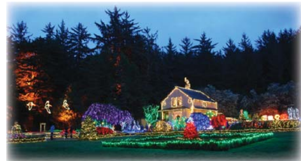
Pelicans and Garden House at dusk.