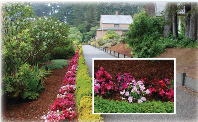
Begonias 'Senator Deep Rose' and Impatiens 'Taboo' along the east walk.

STATE PARKS PROJECTS ALSO INCLUDE PLANTING THOUSANDS OF ANNUALS TO BRIGHTEN UP THE SUMMER GARDENS.