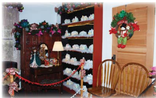
Bedroom with Lighted House Collection