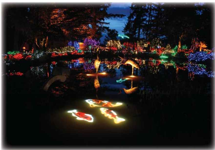
LED Lights, Leaping Frog sculpture, underwater lights on the Herons and new lighted Koi Carp sculptures underwater drew wonderful reviews.