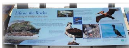
#8 - Life on the Rocks - Introducing the Wildlife of Shore Acres