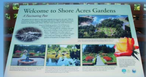
#10 - Welcome to Shore Acres Gardens - A Fascinating Past