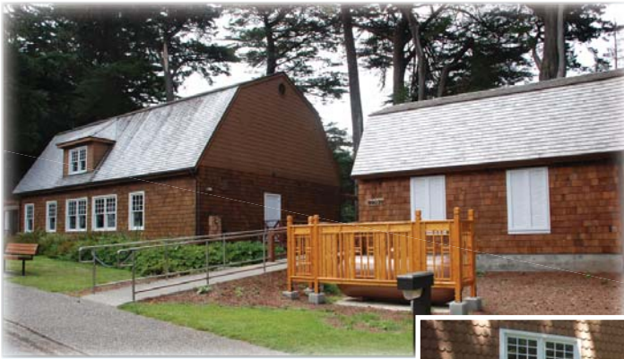
The IGC's climate controlled storage facility, designed by Stuart Woods, is completed. Stuart also designed, built and donated the screen for the propane tank. Thanks!