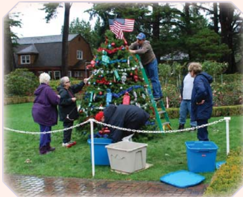
Mid Coast Mustang and Ford Club volunteers decorate their tree.