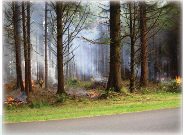
Controlled burn to reduce fuel.

One of the more visible projects this year is the fuel reduction effort. Underway about 1 mile south of the park entrance along Cape Arago Highway, this project is being completed with parks operations and natural resources funding.