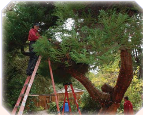
Dell Willis hangs lights on the tall Cryptomeria.

2013 LIGHTS SETUP starts Oct. 19, 2013 To help: 541-756-5401