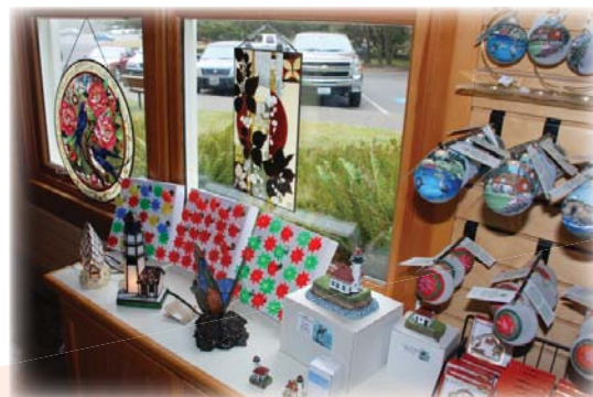
Ornamental glass, holiday lights, lighthouses, and original ornaments are popular items.

We invite you to come and enjoy Shore Acres State Park and the formal gardens and take home a memory of your visit from our shop. ■