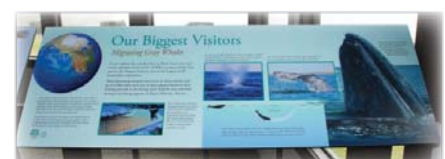
#9 - Our Biggest Visitors - Migrating Gray Whales