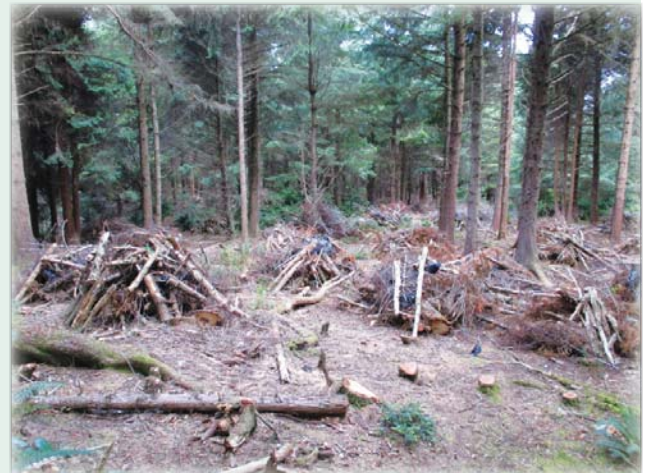
Debris ready for burning.