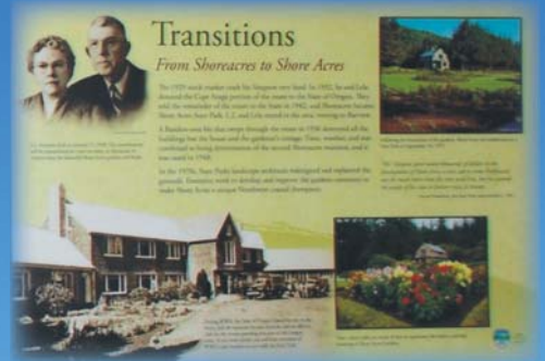
#6 - Transitions - From Shoreacres to Shore Acres