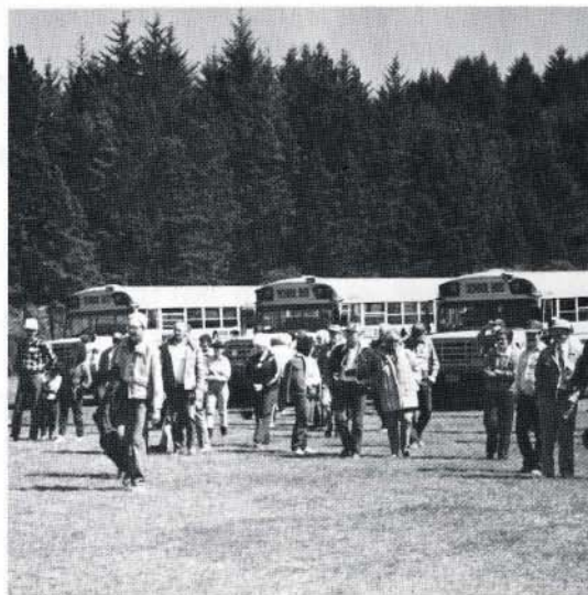
First Convention Tour - Small Woodlot Owners Convention brought 250 visitors to Shore Acres Gardens for guided tours.

Volunteers will also assist the Music Enrichment Association with clean-up after the concert. Call 888-4902 if you would like to help.