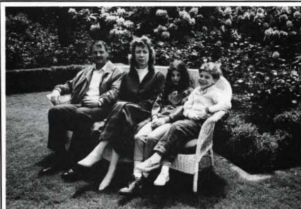
A family poses for picture.