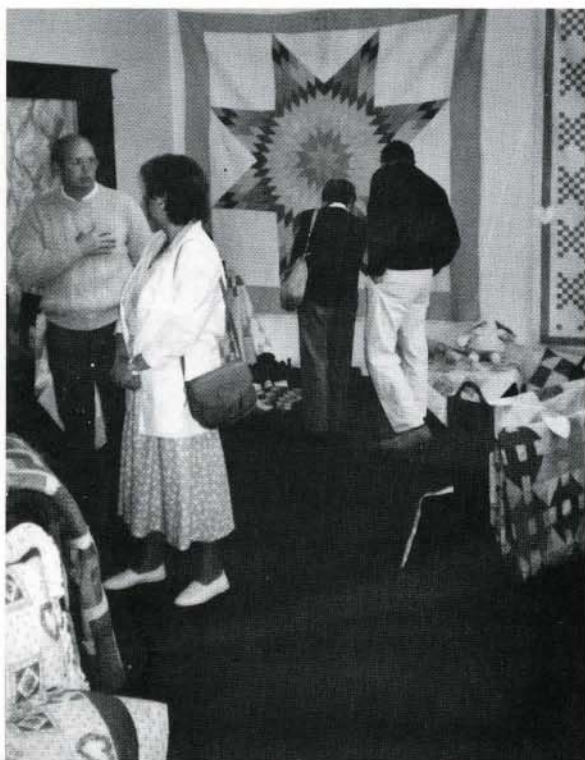
Visitors peruse the quilts.