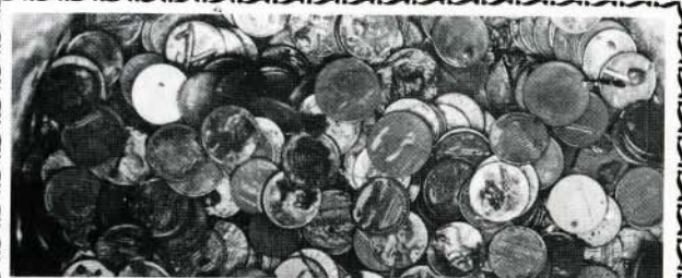
Pond pennies await cleaning.

Shore Acres State Park has received an award for outstanding garden maintenance in 1988 from the All-America Rose Selections. The award signifies that Shore Acres has met high standards of rose care including planting, pruning, pet control, display and identification of roses in the All-America Rose Selection display program. All America Rose Selections is involved in the testing and selection of outstanding new rose varieties in 'test gardens' (like the Portland International Rose Test Garden) and the pre-marketing display of new winners (as at Shore Acres) throughout the nation.