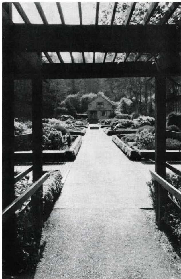
The garden beckons visitors.

You'll like them both, maybe even more than you like the ones to the south. Have a nice summer, and stop in and say "hi" when you're at the park.