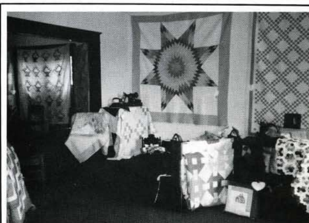
Quilt display adds to the festivities.