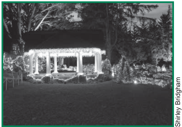
Pavilion at dusk. Notice the uplighting on huge trees. Look for more landscape lighting in 2005 as we continue "framing" the garden.

A.B.A.T.E. of Oregon AM-VETS Post #10 and Auxiliary Bay Area Optimist Club Bay Eye Clinic Bay Area Bonsai Society Bay Area Hospital Boy Scouts - Troop #156 Chinook District Boy Scouts Coos Bay Fire & Rescue Coos Bay-North Bend Rotary Club Coos Bay Yacht Club Coos County Extension Service Coquille Friends Coquille High School Key Club and Kiwanis Harley Owners Group Hauser Dune Riders Life Care Center of Coos Bay Marshfield Class of '40 & Friends Marshfield High School Students Menasha Forest Products Corporation Mid-Coast Mustang & Ford Club Miss Coos County Scholarship Pageant North Bend Education Association North Bend Medical Center Oncology Dept. North Bend United Methodist Church O.M.I.(Operations Management International) Occidental Chapter #45, Order of Eastern Star Oregon South Coast Single Friends Prudential Seaboard Properties Red Lion Hotel - Care Committee Sea Breeze Harmony of Sweet Adelines Soroptimist International of the Coos Bay Area South Coast Cruisers Car Club South Coast Orthopaedic Associates South Slough National Estuarine Research Reserve Southwestern Oregon Community Action Southwestern Oregon Rose Society Southwestern Oregon Street Rods St. Monica Parrish Sterling Savings Bank Sunset Classic Chevys The Bay Area Rotary Club The Gorse Society Umpgua Discovery Center Washington Mutual Wineva Johnson Center XI Gamma Omega Zonta Club of the Coos Bay Area