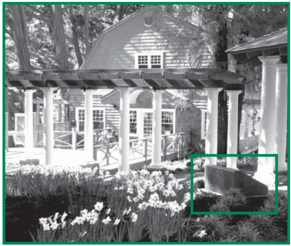
Information & Gift Center and new memorial display.

Hours * March 7 thru Nov. 23 * 10:30 AM - 4:30 PM Thanksgiving thru New Year's * 4:00 - 10:00 PM