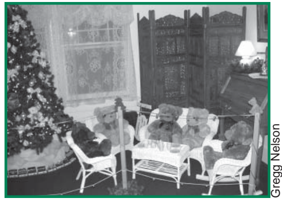
A Teddy Bear's Tea Party in 2004.

I am a great "recycler" and try to accomplish a "new" look each year with a lot of the same stuff! Decorating the Garden House is my "creative endeavor" each year and I look forward to the time spent doing it. (I get to create something beautiful which does not include dishes, mail or laundry!)