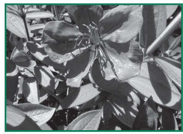
Silky and shiny purple Princess Flower

A good garden plant is more than just having a showy flower. For example, there are more than a few plants that we have tried at various times whose gorgeous blooms pooped out/stopped blooming early in the season and left embarrassing empty spaces in our color spots. Cherokee Sunset has the ability to start blooming by late June and continue on in good form throughout the summer and fall—into October or November or later. In fact as I write this in late January, there are still a few flowers trying to bloom. Moreover, this variety is very tolerant of the cool summer temperatures, wind, salty sea fogs, and the less than perfect soils that pretty well typify the "normal" growing conditions here. All in all, a standout garden plant that successfully combines beauty, reliability, and just plain gorgeous gumption; amply justifying all the favorable comments and questions received from so many park visitors on this special plant—all the other plants are jealous!