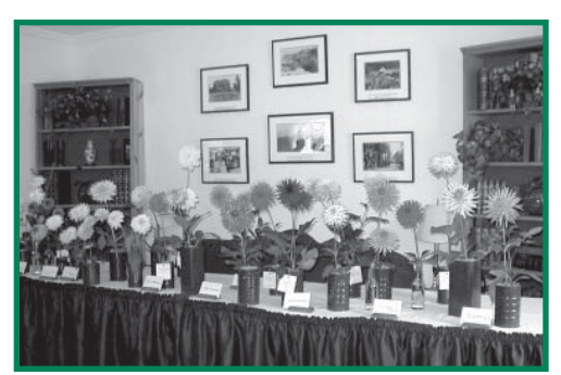
Dazzling Dahlias in the Garden House

uring the year, the Friends of Shore Acres sponsor "flower days" when the garden house is open from 11 AM to 4 PM