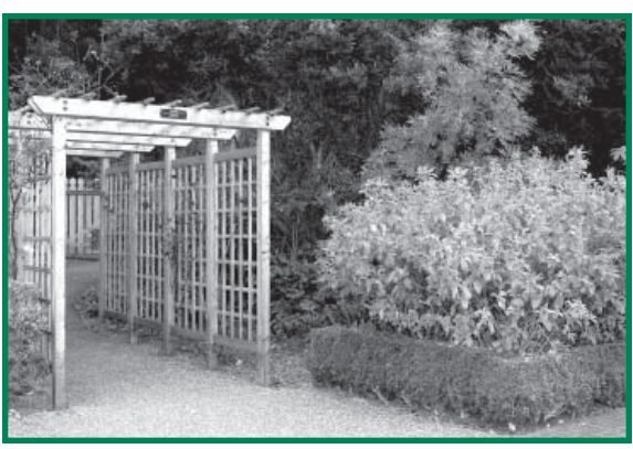
Rose pergola and Princess flower behind hedge.

Since it is relatively easy to propagate from cuttings, has long lasting beautiful flowers, and is tolerant of our growing conditions, it's interesting that more people around here aren't growing the princess flower. Luckily, some local nurseries are growing and selling the plant so if anybody is looking for a plant that will grace their gardens in purple splendor (while making the neighbors green with envy) plant a tibouchina and while you're at it plant a few rudbeckias.