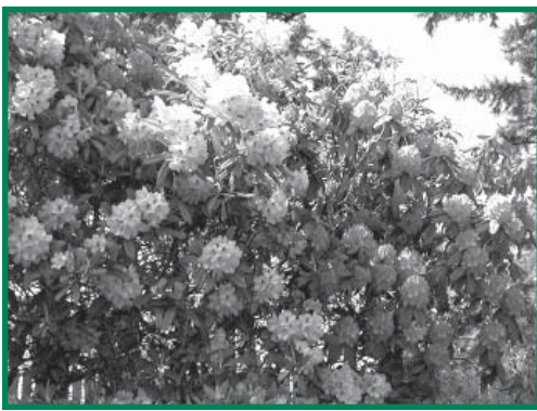
Regal rhododendrons on the west side.