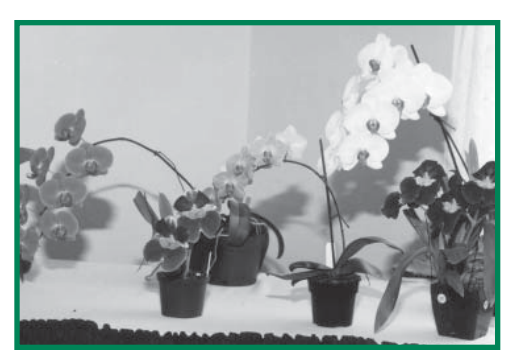
Orchids "Gems of the Rain Forest'