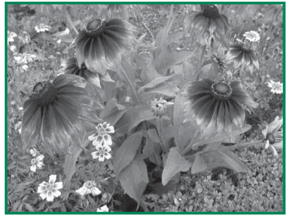
Velvety mahogany Rudbeckia - "Cherokee Sunset"

However, the variety "Cherokee Sunset" that we have been growing the last couple of seasons has much more flash and attitude: 3-4 inch wide flower heads that are often elaborately crested like a florist's chrysanthemum in shades of molten yellow, orange, bronze, and mahogany. A particular plant's flowers may sometimes include