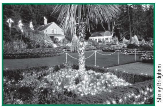
Dusk is a favorite time for many.