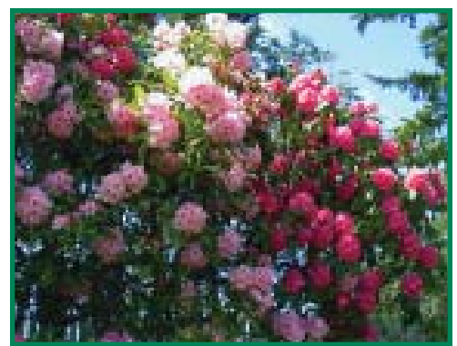
Regal rhododendrons on the west side.