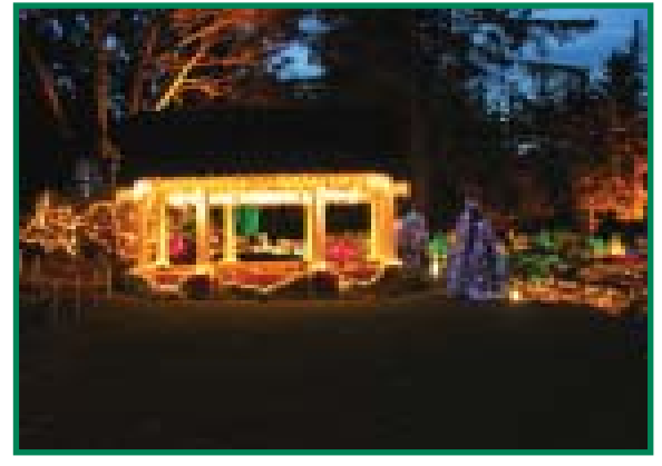
Pavilion at dusk. Notice the uplighting on huge trees. Look for more landscape lighting in 2005 as we continue "framing" the garden.