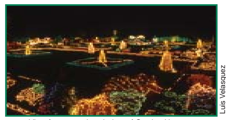
View from upstairs window of Garden House.