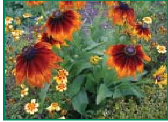
Velvety gold and mahogany Rudbeckia - "Cherokee Sunset

However, the variety "Cherokee Sunset" that we have been growing the last couple of seasons has much more flash and attitude: 3-4 inch wide flower heads that are often elaborately crested like a florist's chrysanthemum in shades of molten yellow, orange,