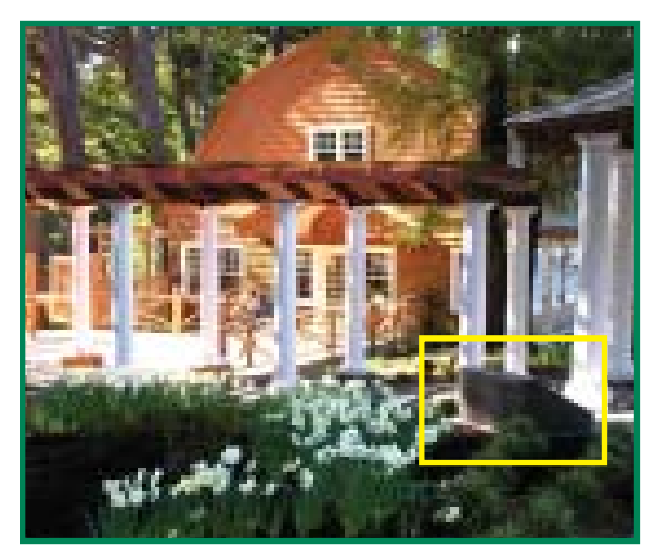
Information & Gift Center and new memorial display.

Hours * March 7 thru Nov. 23 * 10:30 AM - 4:30 PM Thanksgiving thru New Year's * 4:00 - 10:00 PM