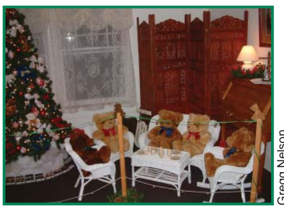
A Teddy Bear's Tea Party in 2004.

I am a great "recycler" and try to accomplish a "new" look each year with a lot of the same stuff! Decorating the Garden House is my "creative endeavor" each year and I look forward to the time spent doing it. (I get to create something beautiful which does not include dishes, mail or laundry!)