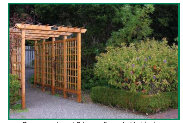
Rose pergola and Princess flower behind hedge.

Since it is relatively easy to propagate from cuttings, has long lasting beautiful flowers, and is tolerant of our growing conditions, it's interesting that more people around here aren't growing the princess flower. Luckily, some local nurseries are growing and selling the plant so if anybody is looking for a plant that will grace their gardens in purple splendor (while making the neighbors green with envy) plant a tibouchina and while you're at it plant a few rudbeckias. ~