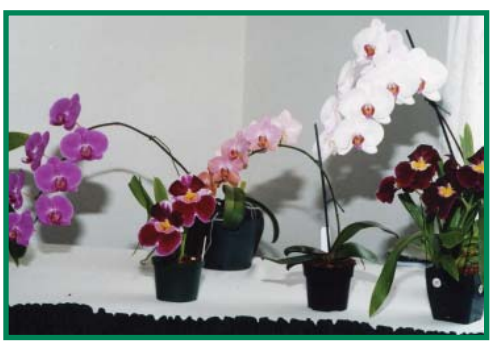
Orchids "Gems of the Rain Forest"