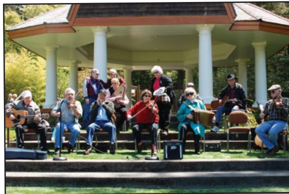
Old Time Fiddlers - Rhododendron Sunday

Previously we have improved the wiring, lighting, heating, kitchen and carpet.