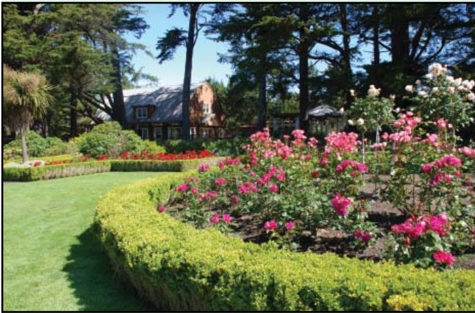
Ravishing roses in the Summer

In with the new - out with the old. We have cleared out many of the old book lines and added many new titles. There are lots of new puzzles, in fact all have been changed.