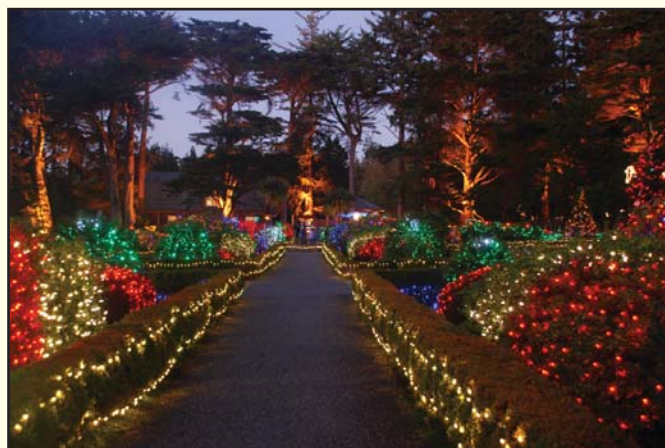
"LED Land" enhanced with landscape lights on huge trees