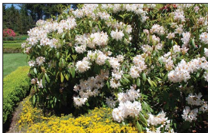
Rhododendron and Yellow Lithodora

TO SEE THE DETAILED REPORT, GO TO WWW.SHOREACRES.NET AND CLICK ON "HOLIDAY LIGHTS"