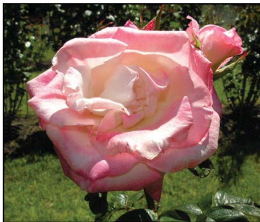
Rose in the AARS Rose Display Garden