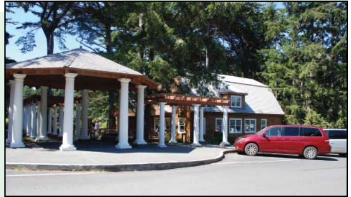
Entrance and IGC reminiscent of the Simpson era.

Yes, we have a great Penny machine with 4 designs (Cape Arago Light House, OPRD Logo, Garden House and Pond). There is also a passport to hold all your designs.