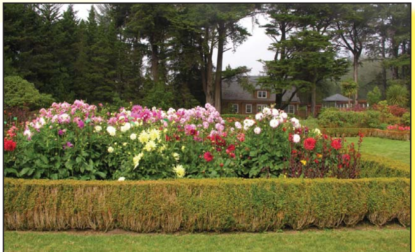
Boxwood hedges in the English Formal Garden were planted in 1975.

These are just a few things to watch for in the garden, this year. I am looking forward to working on these projects and other challenges in my new position at Shore Acres State Park. ~