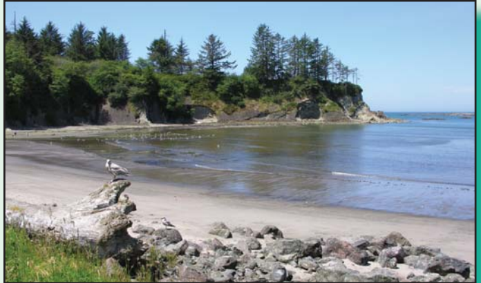
Sunset Bay South

Day time program topics can vary as much as the weather. Tidepool walks, W.W. II history walks to the bunkers, native plant walks, Jr. Ranger programs for kids ages 6-12, and Shore Acres Simpson history strolls are just a few of your choices. Evening