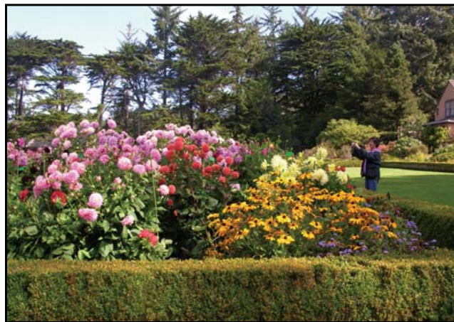
Dazzling dahlias delight visiting photographer!