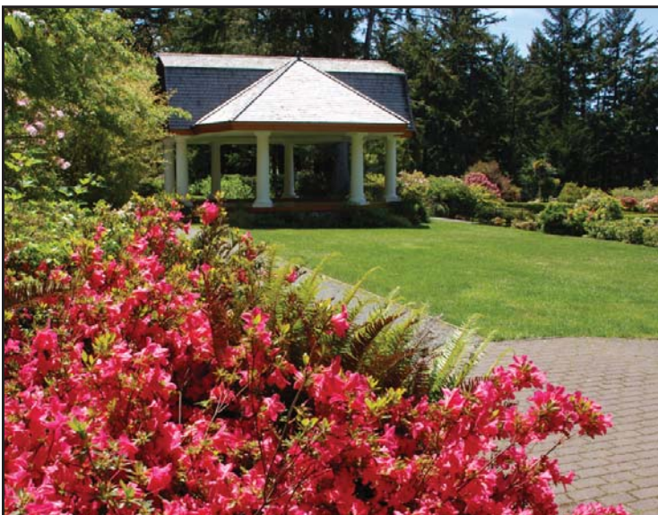
Awesome azaleas near the Pavilion

Also, the Friends will park cars and sell sundaes and lemonade at the Oregon Coast Music Festival garden concert on Saturday, July 18 at Noon. The Information & Gift Center is open all year, giving park visitors excellent shopping opportunities, as well as providing information and many interpretive brochures. While Shore Acres is all abilities accessible, wheel chairs are available for loan at the IGC. ~