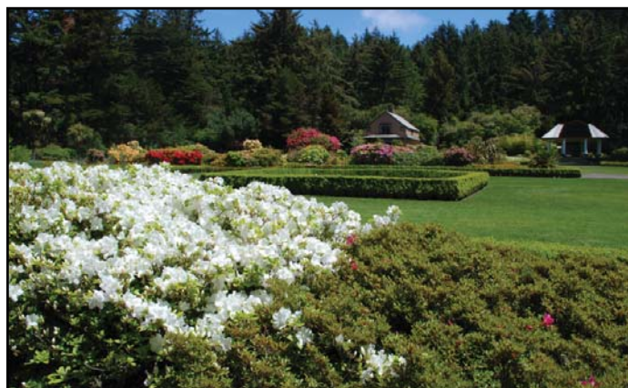
Rhododendrons and Azaleas in Spring