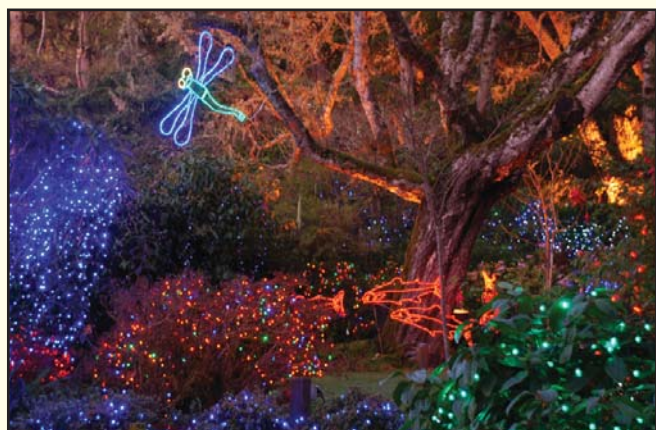
New dragonfly above the salmon