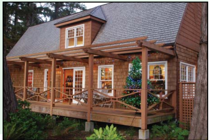
IGC welcomes visitors year'round.