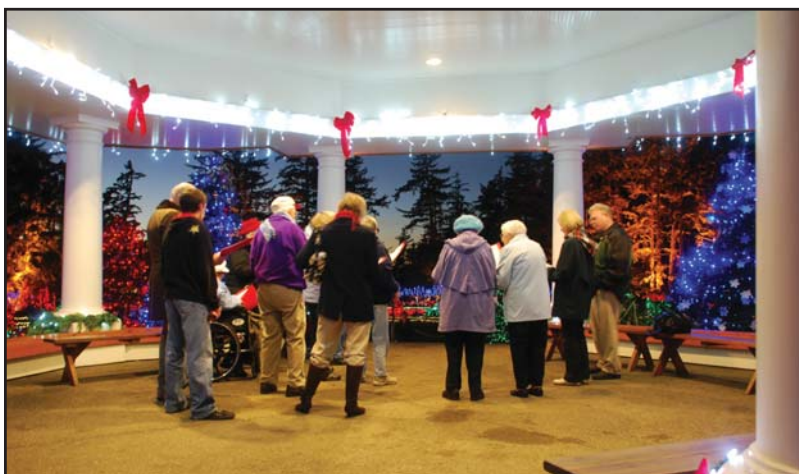
First Presbyterian Church-Joy Ensemble enjoy the view while entertaining in the Pavilion on a beautiful clear night.