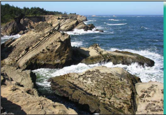
Shore Acres Cliffs South

Come join us in discovering all the beautiful things about this place we call home. No R.S.V.P needed! ~