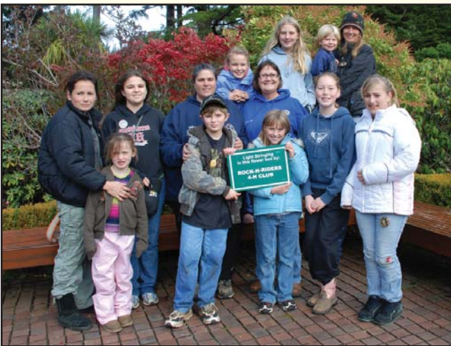
Rock-n-Riders 4-H Club decorated a flower bed.