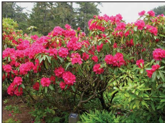
Springtime rhododendrons at Shore Acres