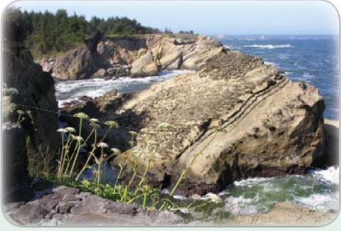
Shore Acres' Simpson Beach and Cliffs