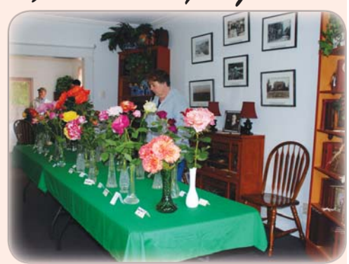
Lovely display of roses by members of the SouthWestern Oregon Rose Society

Dahlia Day - Sept. 27 Southern Oregon Dahlia Society "Dazzling Dahlias"