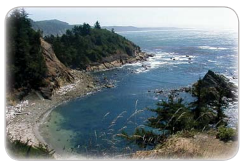
Cape Arago South Cove

Friends of Shore Acres, Inc. has provided me with a foundation for success and an opportunity to share my passion of learning and education with the public. I am grateful to be part of this community and I feel privileged to work beside dedicated and compassionate folks. Certainly, I love my job.