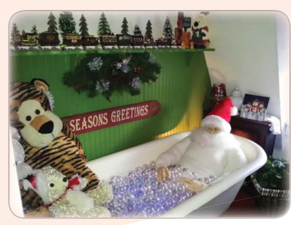
A bubble bath for Santa