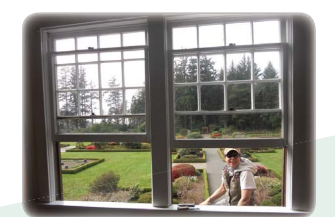
Preservation Nearly Complete