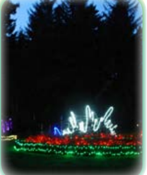
The Orca Whale leaping perfectly in 2016.