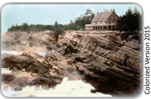
First Mansion on the Bluff, Circa 1910