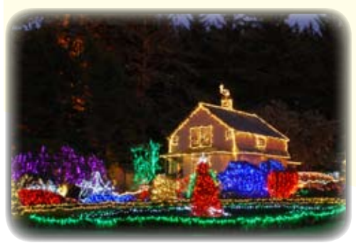
Holiday Lights at Shore Acres 2011