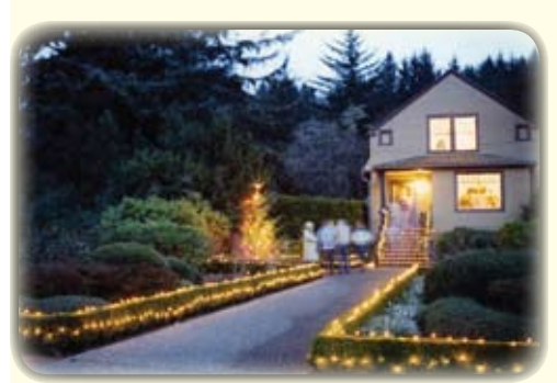
Christmas at Shore Acres 1987

See the list of very capable people and their responsibilities on PG 2. \hfill \blacksquare