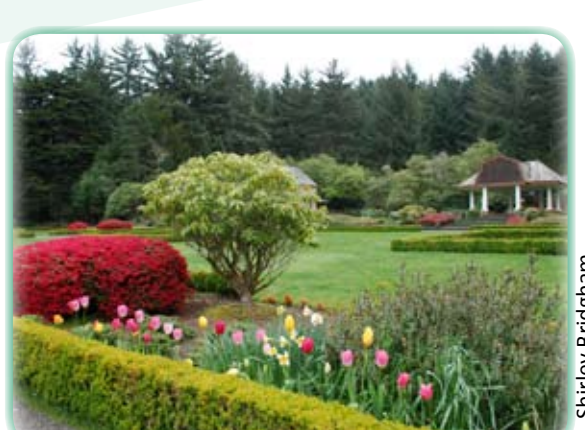
THE PROMISE OF SPRING . . .