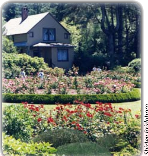
Rose Sunday, Father's Day June 19, 1989

members of the SouthWestern Oregon Rose Society have been involved with Rose Sunday on Father's Day every year since 1989. Besides setting up a delightful display in the Garden House, they answer the many questions that visitors have while Friends volunteers serve punch, coffee and cookies. It's a win-win situation for all involved – especially Shore Acres.