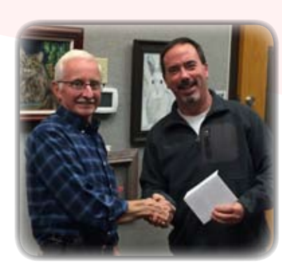
Congratulations 70 All!