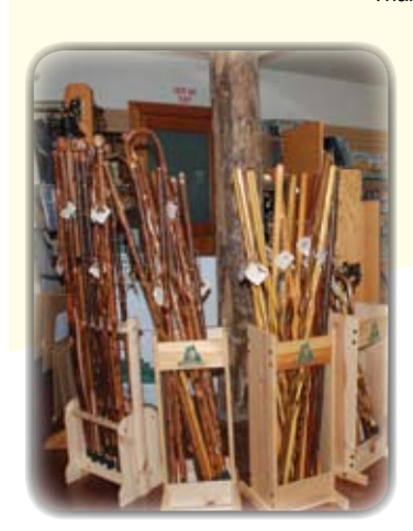
WALKING STICKS AND MORE

OPEN HOURS ◆ Jan. THRU Feb. 11:00 AM - 3:00 PM ◆ Mar. THRU Thanksgiving Eve - 10:30 AM - 4:30 PM Thanksgiving thru New Year's Eve - 3:30 -9:30 PM ◆ 541-888-2472 ◆ 1-866-6100