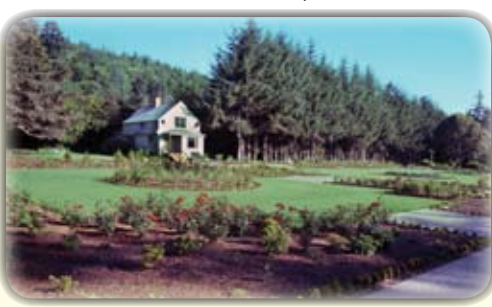
Garden House and Gardens 1975