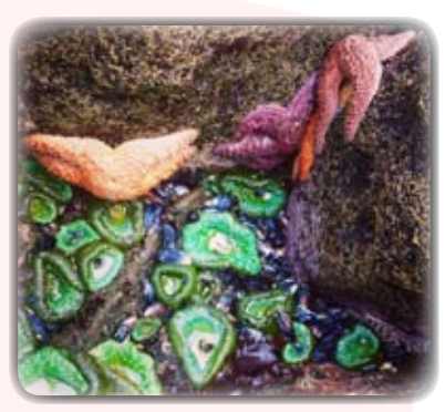
The seastars appear to be beginning to make a comeback at Cape Arago, after seeing their numbers drop significantly the past three years, due to Seastar Wasting Disease.