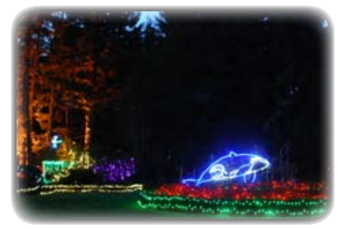
Leaping Orca at Shore Acres 2016