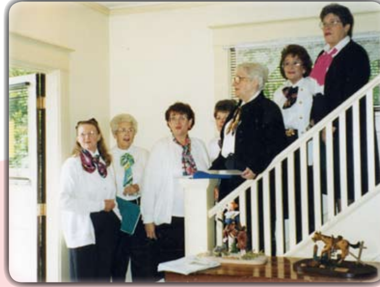
Coos Shoreline Chapter of Sweet Adelines