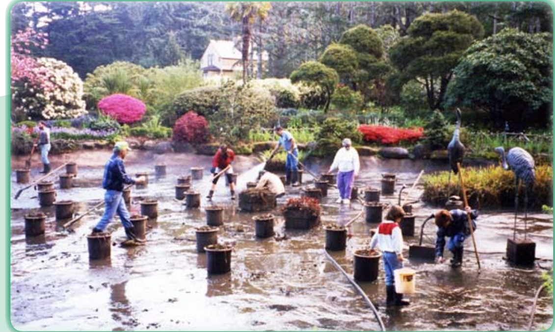
BLM volunteers are used to the muck; they’ve cleaned it before!

In cooperation with park staff, these groups organize other volunteers, provide public programs, help plan and conduct special events, and perform other services.