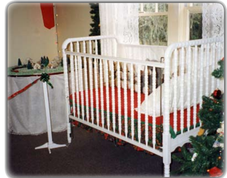
Child's bedroom featured a crib filled with bears, a train, a village, a Christmas tree and toys.