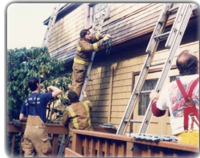
Volunteer firefighters are willing to go where most won't go!