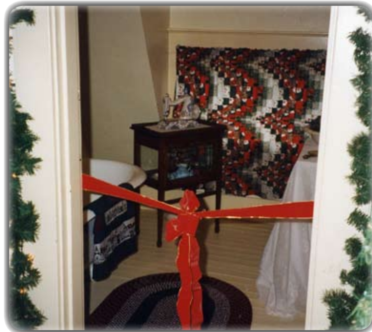
Upstairs bathroom with claw bathtub