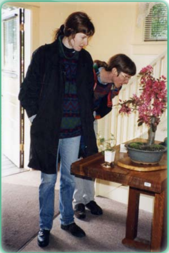
In the Garden House, visitors take a close look at exquisite bonsai.

“THE COLOR GREEN” is the theme for an 11 a.m. to 4 p.m. display by the Bay Area Bonsai Society Saturday, March 18, at Shore Acres State Park. The display will be held in the garden house and will include a variety of examples of bonsai. Tea and fortune cookies will be served by the Friends of Shore Acres and society members will be on hand to answer questions. Visitors will also be directed to the Oriental section of the garden near the reflecting pond. For information on the free event call 756-4450 or 888-3732.