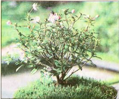
A fly lands on a 10-year-old Kalmiopsis Leachiana.

"Basically, you restrict the plant's roots so its leaves begin to