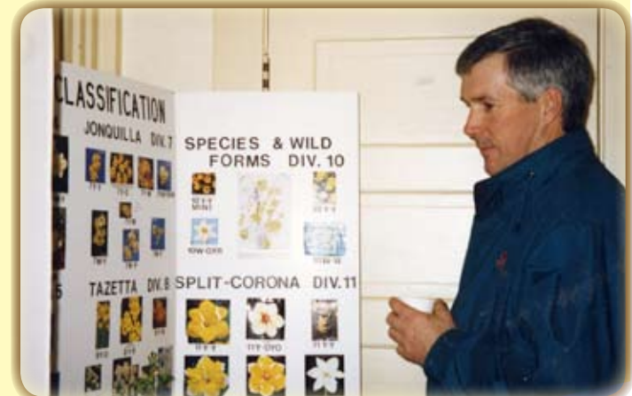
Visitor studies daffodil information.