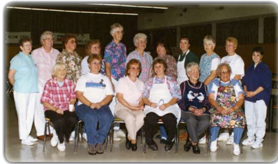
Volunteer bakers at North Bend High School