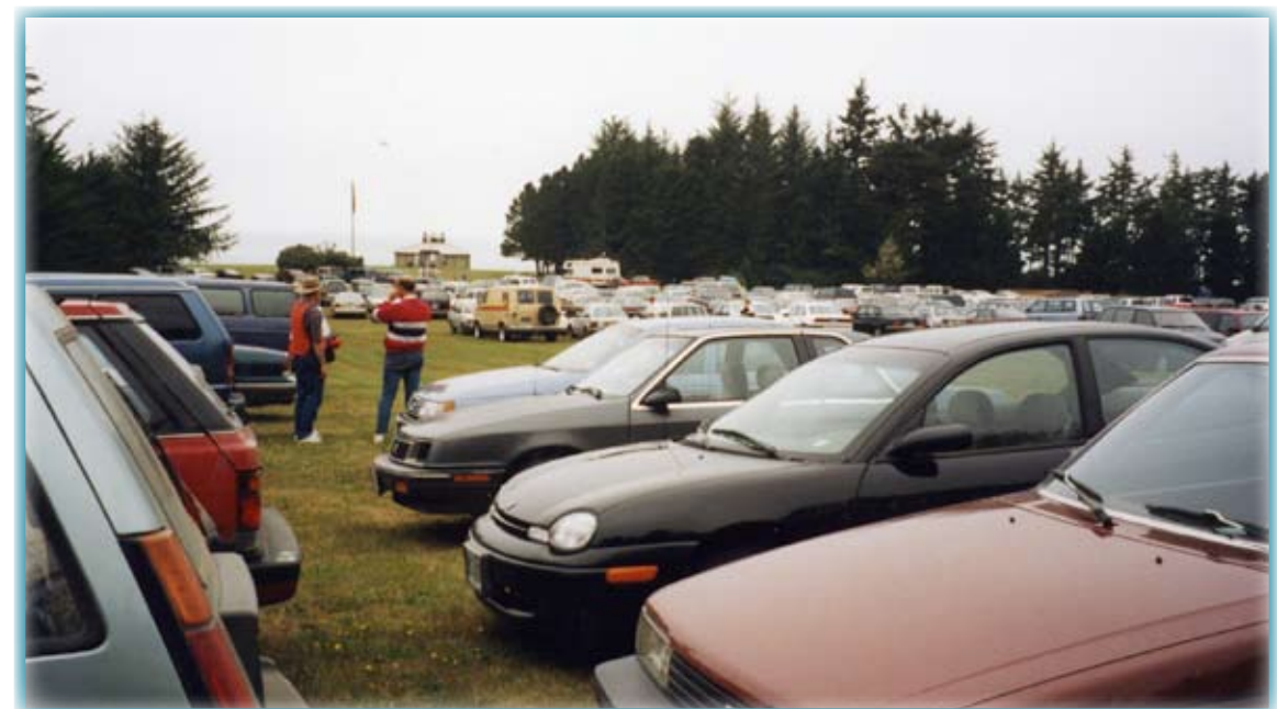
Friends' volunteers directed cars in a full field of parking.