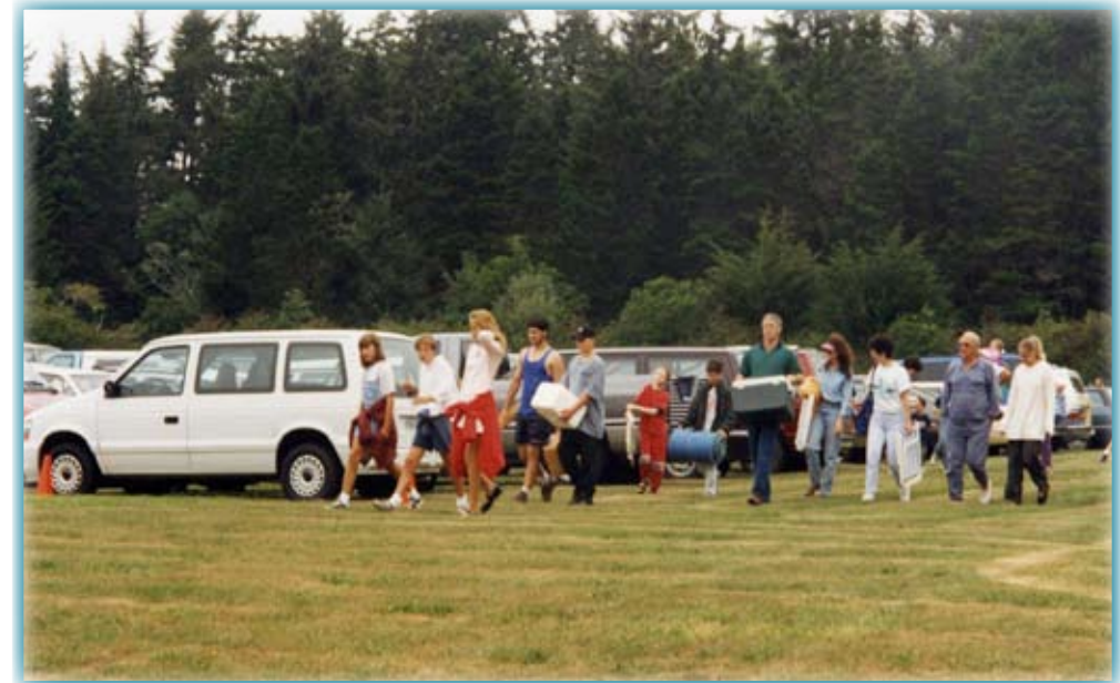
Crowds and picnic baskets were the order of the day.

The garden concert at Shore Acres is a highlight of the annual Oregon Coast Music Festival. This year was no exception. Golden Bough's Celtic and folk music delighted the large audience and Friends of Shore Acres' fresh raspberry and chocolate sundaes were a sellout.