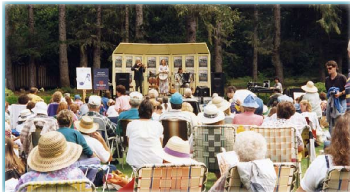
Golden Bough is always a favorite group.