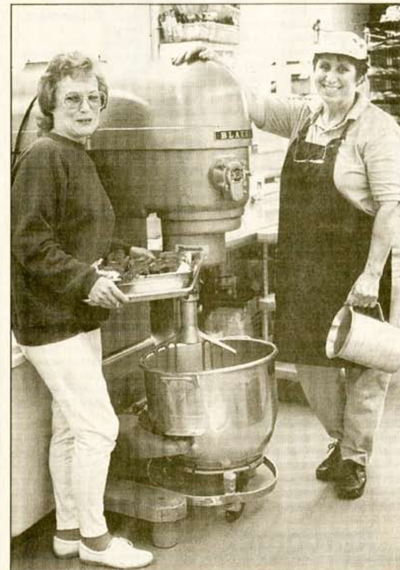
Cream 12 pounds of butter? No problem with this machine.