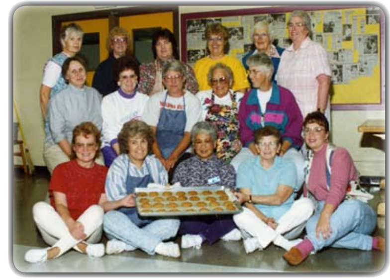
Volunteer bakers at Marshfield High School