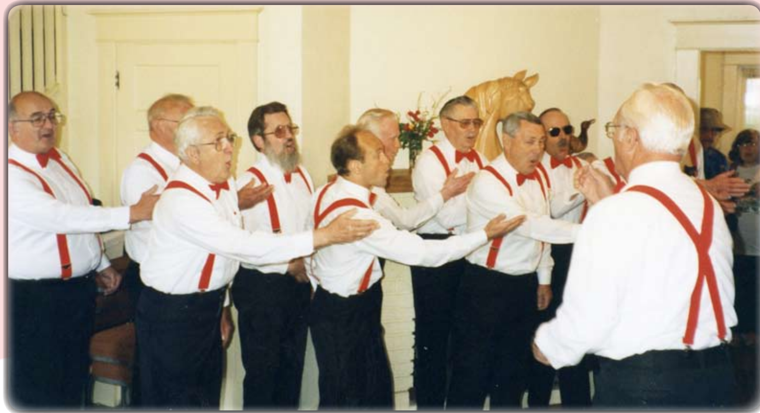
Gold Coast Chorus