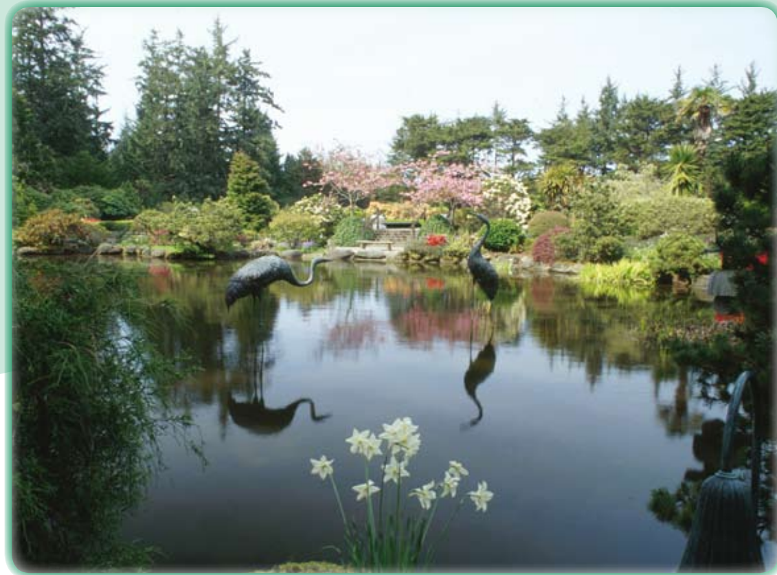
The result - a clearly beautiful pond.