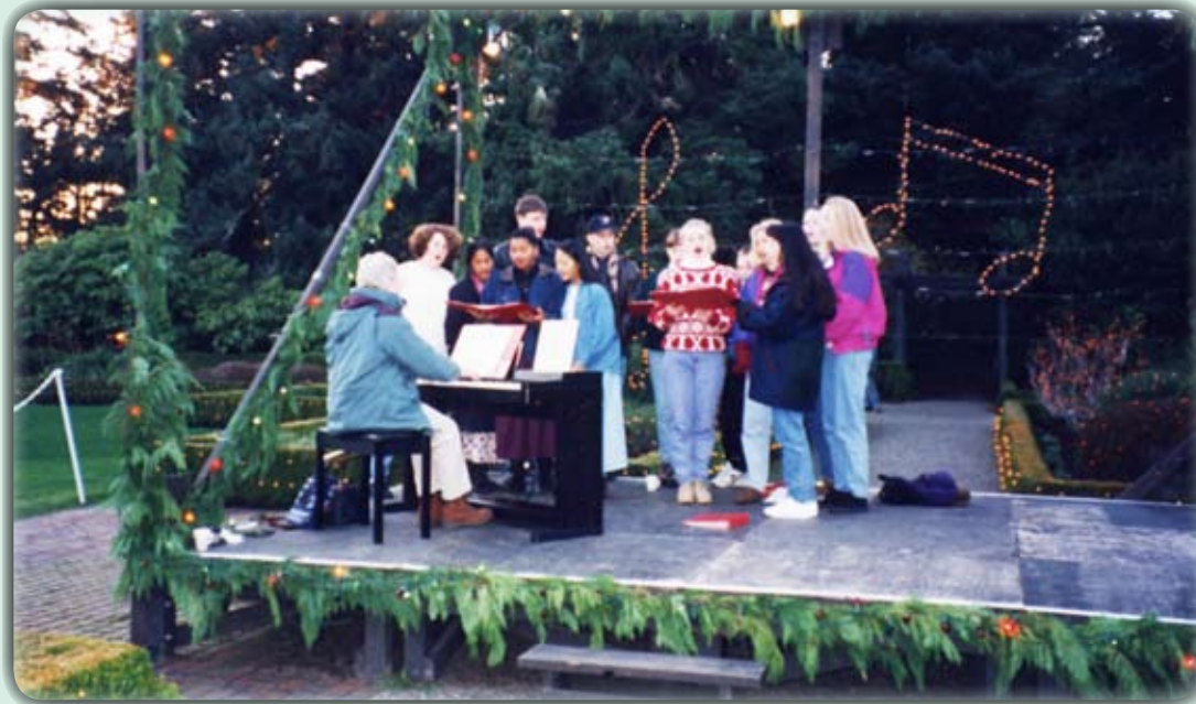
Caroling started early some nights. Entertainment was weather permitting.