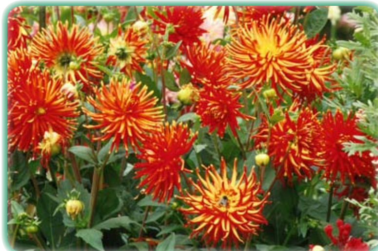
Summer / Autumn Dahlias at Shore Acres Gardens