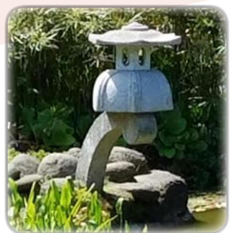
48 HOURS AND STILL STANDING