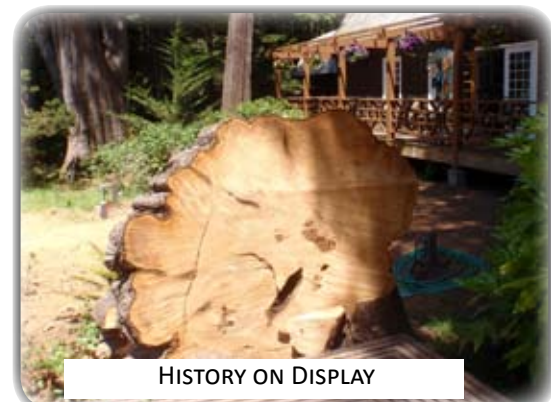
HISTORY ON DISPLAY