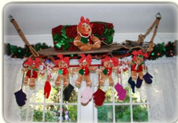
More Gingerbread in the kitchen