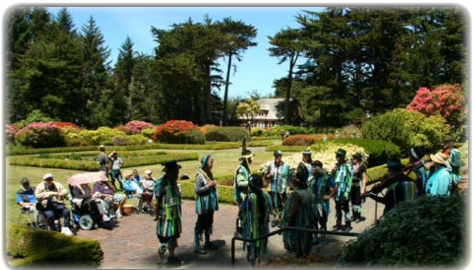
Tide Morris Dancers