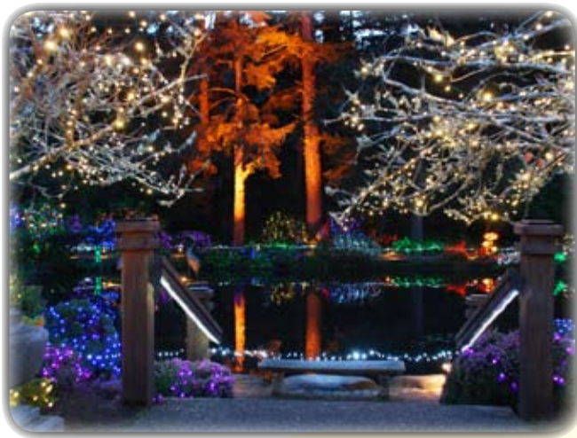
Reflections in the Lily Pond