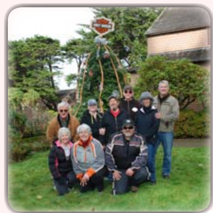
H.O.G. Harley Owners Group