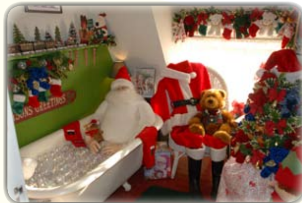
Santa – always a “must.”