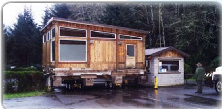
2003 - A TIGHT FIT AT SUNSET BAY CAMPGROUND WATCHED BY ANDY LATOMME

In 2003, the current Friends' Information & Gift Center was built to replace the one built by the Friends and the park in 1992.