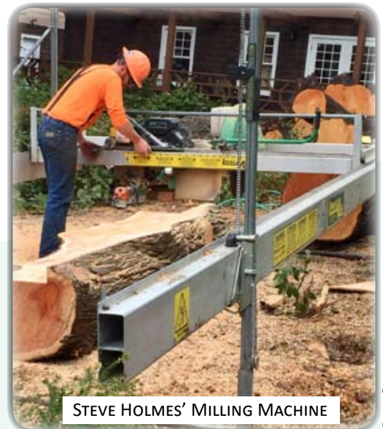
STEVE HOLMES' MILLING MACHINE

have been dead and dying for many years. The underlying cause of the root decay was the shallow water table in that location which lead to root degradation. The tree still had many fine roots and anchor roots on the north side of the tree which kept the tree in a healthy full crown condition. The root structure could no longer support the tremendous weight of the full crown and very large and heavy tree bole and subsequently the tree buckled and fell due to the overwhelming amount of weight on that side of the tree. Several Scheinitzil conks were found 25 feet to the west of the tree however, those conks were associated with an old spruce stump and none of the surrounding cypress trees in the immediate vicinity. Roots were check/drilled on the adjacent cypress tree leaning toward the gift center. No evidence of root decay was found on that tree. ■