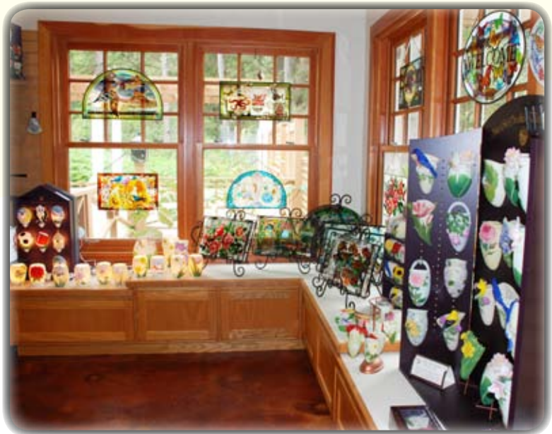
EVER POPULAR NIGHT LIGHTS AND MORE

For hikers – walking sticks, energy bars, sunflower seeds and candy bars. For historians – many books related to our area. For students – books and science project kits. For bird watchers – binoculars, feeders, and books about care or identifying our local birds. For many – information and houses for bats. For kids – a wide range of puppets, toys, puzzles and activities. For great memories – DVDs of park history, Holiday Lights and screen savers. For your fashion needs – jackets, sweatshirts, T-shirts, jewelry, purses and more. For fun – soaps and pine baskets. For decoration – sculptures, night lights and glassware . . . and the list goes on. Many of these products are made in the USA, Oregon and locally. ■