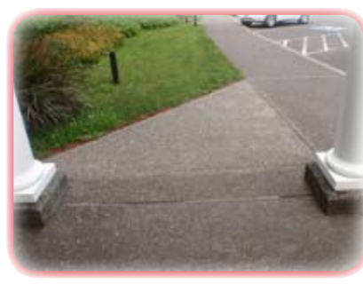
Two aggregate walkways (L) replace asphalt near the Greenhouse with two new aggregate sections added at the entrance.