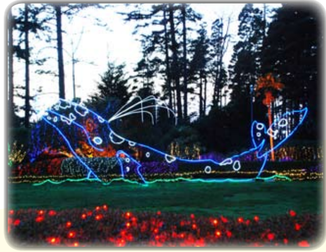
45' Gray Whale - Frame refinishing and all new rope lighting added by David Bridgham in 2017