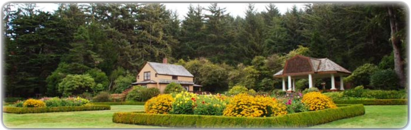
Dahlias and Black-eyed Susan plants at Shore Acres Gardens