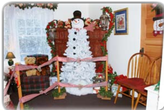
New addition in the kids’ bedroom