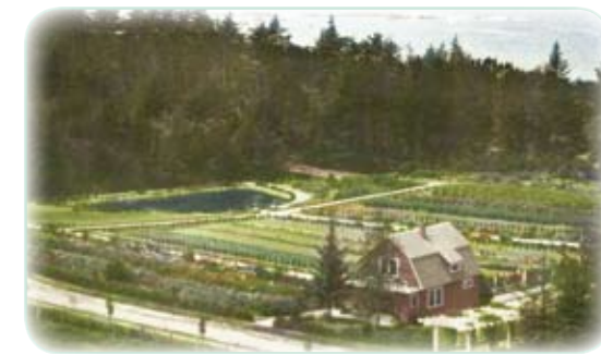
Garden House (former Gardener's Cottage) - early 1900s - Note the half-moon shape of the first pond which Simpson would modify to present shape, circa 1914