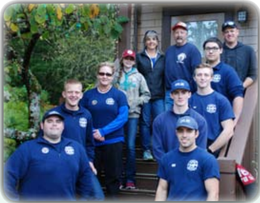
Coos Bay Fire Department Volunteers

Lights high on the house and on hundreds of shrubs in the Gardens