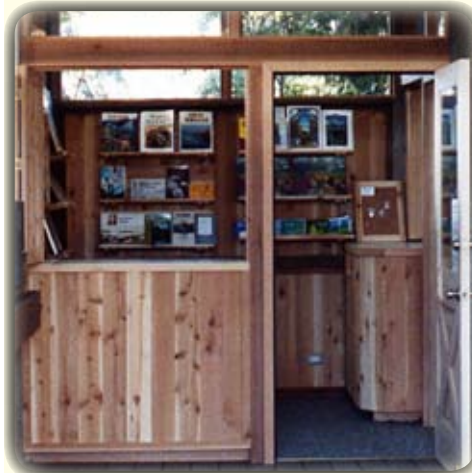
The 8' x 8' GAIC built in 1988