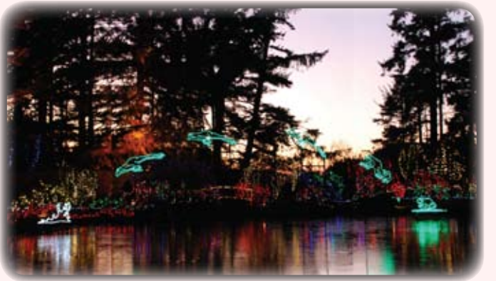
2003 "Leaping" Frog in Pond: Design - Don McMichael; Fabrication-Eric's Artistic Expression; Lighting-David Bridgham; 2015 Animation -Solid State Digital Controller