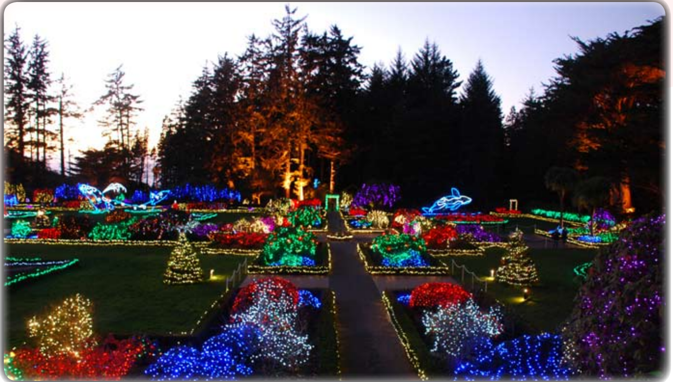
A Favorite View from the Garden House Window at Dusk - A Tantalizing Transition from Daylight to Dark!