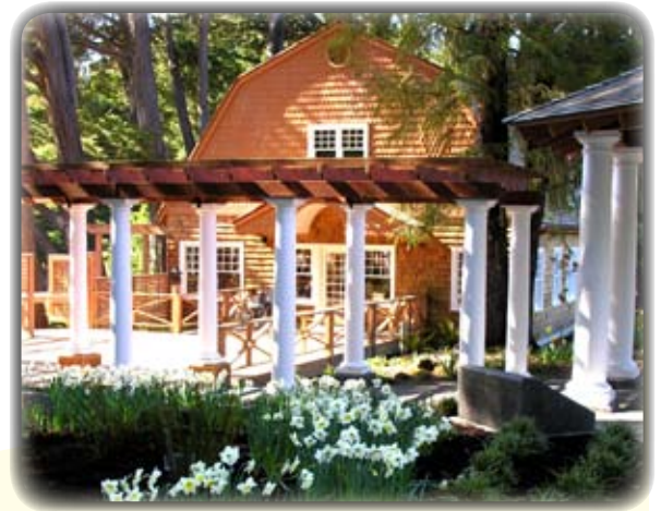
The IGC built in 2003

The Shore Acres Information and Gift Center continues to be an all-volunteer enterprise for the Friends. It is open daily including holidays except for inventory during the first day or two of January. Come check out one of the finest information and gift centers on the Oregon Coast! ■