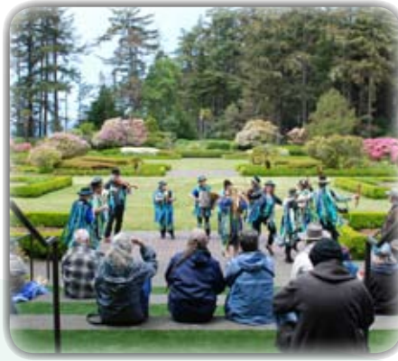
Tide Morris Dancers