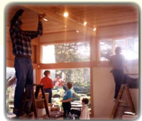
The 24' x 24' IGC built in 1993

As the local IGC Volunteers Coordinator, I'm amazed at how he finds so many new and unique items to include in the IGC Inventory. (Continued page 5)