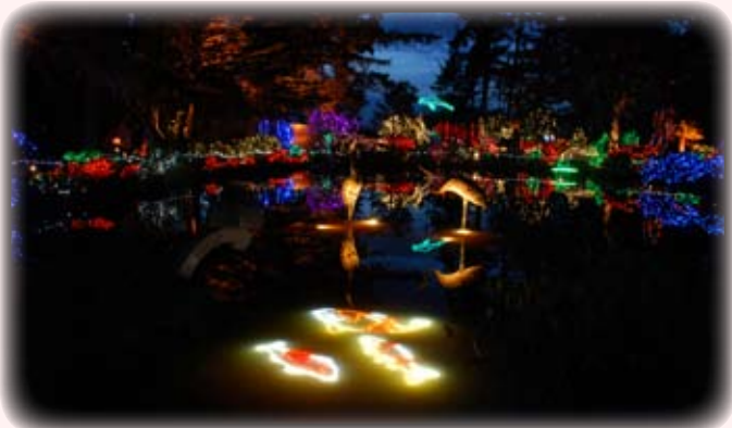
2012 Koi Underwater in Lily Pond: Design, Fabrication and Lighting - David Bridgham