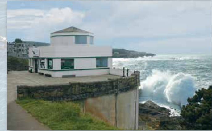
Whale Watching Center

Not sure where to start? The Oregon State Parks Whale Watching Center in Depoe Bay is the hub for all things whales. The center features interactive whale exhibits and expansive views of the Depoe Bay coastline. Its central coast location makes it a great jumping-off point for your adventure.