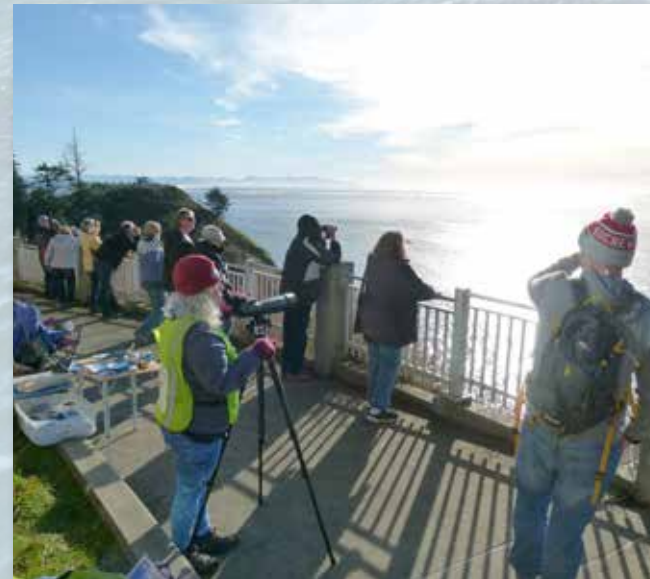
Whale Watch Week, Dec. 2018.

If you can't make it during one of the Whale Watch weeks, that's OK; the whales are still here! A small group of about 200 Gray whales remain in coastal waters every year, June - October. Summer months can be the best times for up close views of the whales. The Whale Watching Center is open to visitors year-round, as are all of the watching spots in state parks.