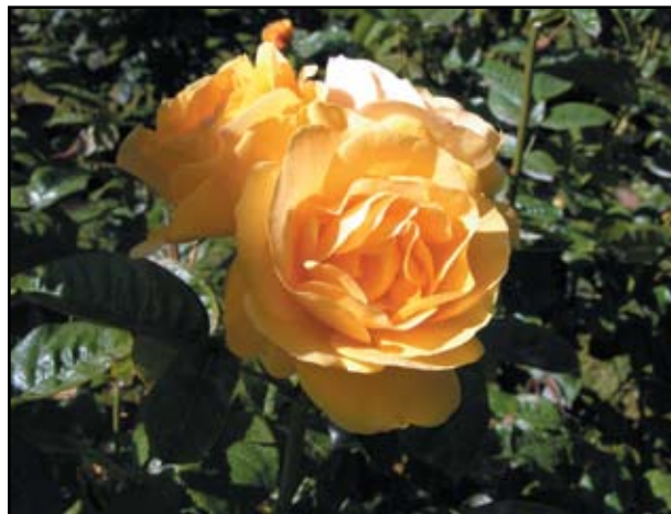
Julia Child AARS 2006