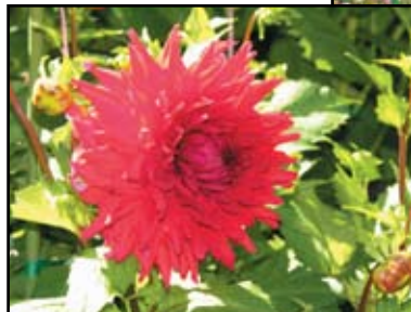
"Shore Acres" Dahlia