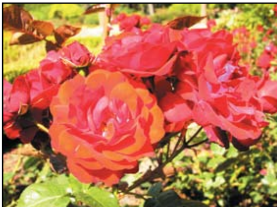
Showbiz AARS 1985