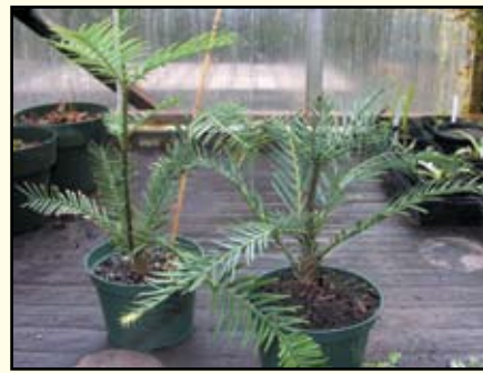
“Wollemi pines” ( Wollemia nobilis )