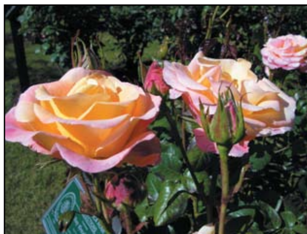
Daybreaker AARS 2004