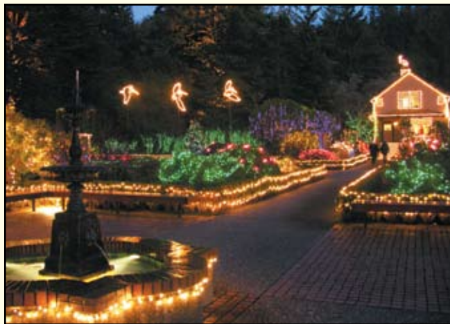
Holiday Lights 2006 featured more L.E.D. lights in the display. Note the pink/purple lights on the large rhody near the House.