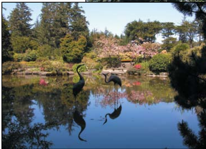
The serenity of birds and blossoms at the 100' lily pond.

This will be a banner year, as we help the park replace many rhododendrons and other plants and as we move into more low energy lighting for the holiday lights. We are investing in the future and thank all of you for your continued support that, indeed, makes Shore Acres "More than Lights." ~