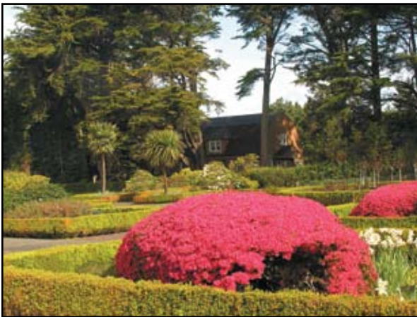
Looking across Hino crimson azaleas toward the towering Monterey cypress and Friends' Information & Gift Center.