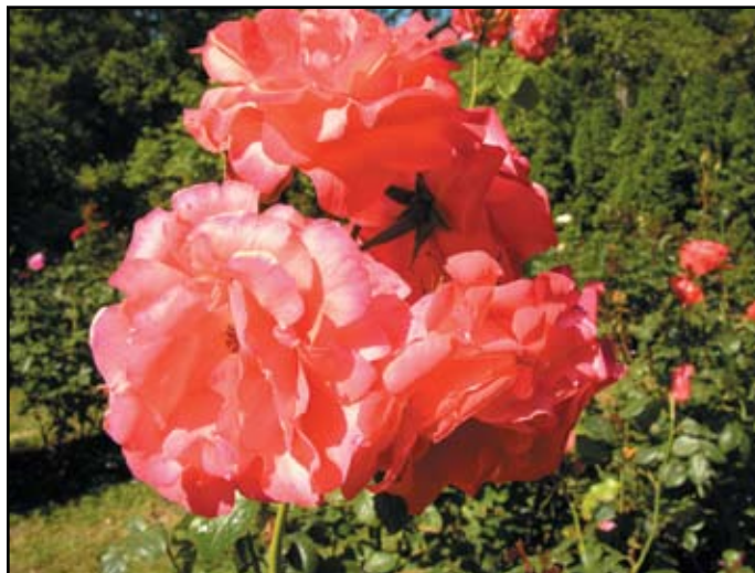
Marmalade Skies AARS 2001