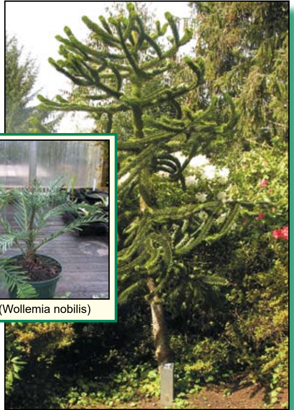
“Monkey puzzle tree” ( Araucaria araucana )