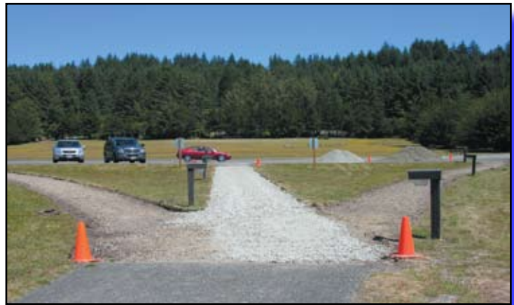
New path site after removal of asphalt.