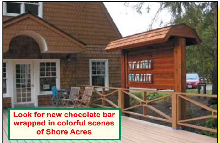
Look for new chocolate bar wrapped in colorful scenes of Shore Acres