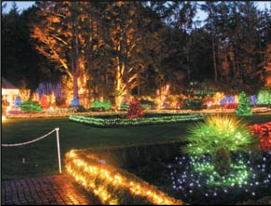
Landscape Lighting on the giant Monterey Pines