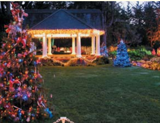
Spectacular L.E.D. lights on Christmas trees.