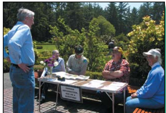
Rose Sunday, Father's Day 2006

When you get down to it – it's about the people. Regardless what hat you wear— Friends of Shore Acres volunteer, State Parks management and staff, community volunteers and supporters — people are what make Shore Acres and the Friend of Shore Acres so great, and will into the future for some time to come. ~