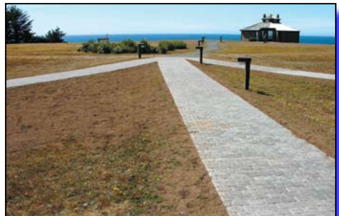
Completed Path Project - Beautiful!