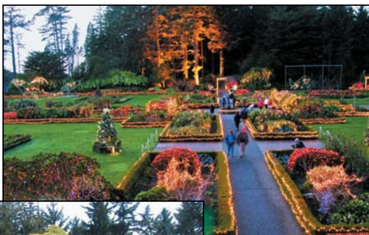
Landscape lights on huge west side trees help frame the formal garden full of lights.

Lights visitors return to see the flowers and garden visitors return to see the lights! And our Information & Gift Center and annual events thrive and provide resources for us to help the park.