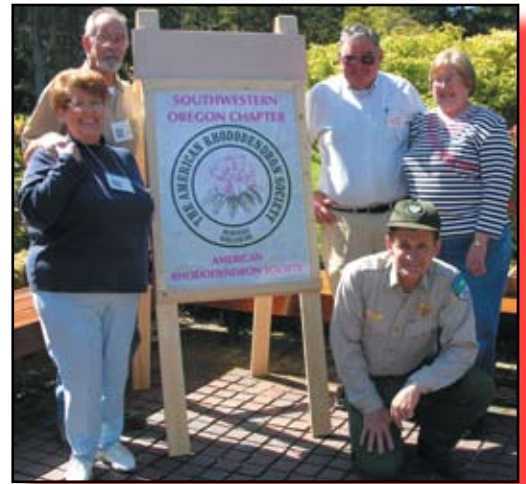
Rhododendron Sunday, Mother's Day 2006

Through the years we have often had an extra surprise or treat along the way – cookies, coffee and punch in the garden house and seasonal “paint outs” with community artists creating paintings in the gardens while you watch! The woodcarvers in our area—and they are very well represented and talented—display and demonstrate in the garden house. Those are unexpected treats found from time to time by our traveling visitors. It often becomes the highlight of their travels. ~