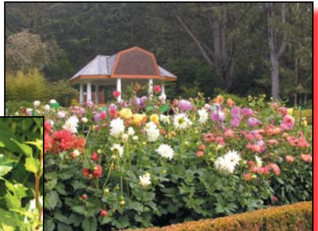
Dazzling Dahlias in September