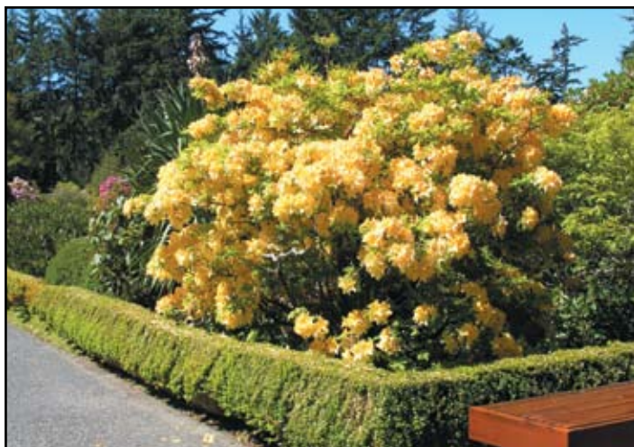
Exbury "Yellow" Deciduous Azalea in front of the Garden House