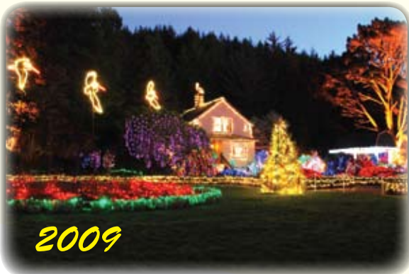
275,000 LIGHTS - MOSTLY L.E.D.