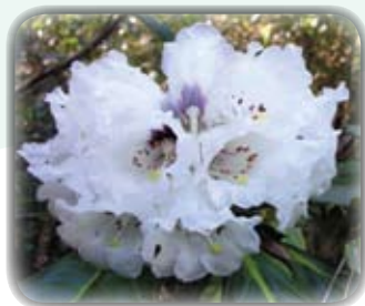
SPRINGTIME IN THE GARDENS - MAY 13, 2020. - View from the upstairs window of the Garden House. Azaleas and rhodies starting to bloom.

FOAM BUILD-UP AT SIMPSON BEACH during the January 11, 2020 King tide event. In Larry Becker's and Ellie Kinney-Martial's 25+ years of working at Shore Acres they had never experienced the foam action this deep and extensive. King tides arrive when the sun, moon, and earth are in alignment, causing a stronger than usual gravitational pull.