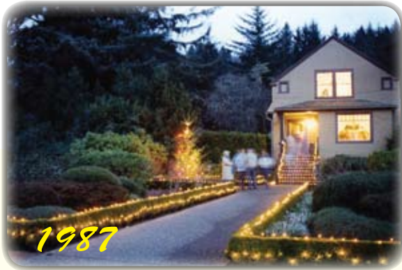
6,000 MINIATURE LIGHTS