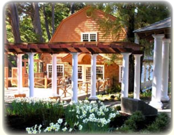
The IGC built in 2003