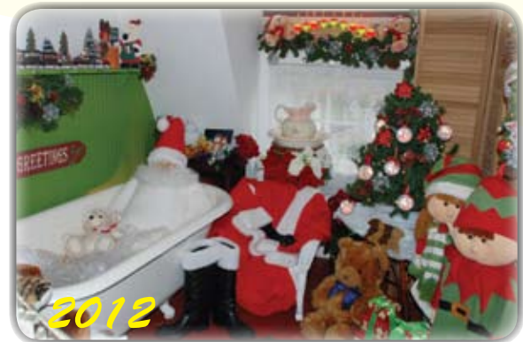
SANTA IN THE TUB - A "MUST"