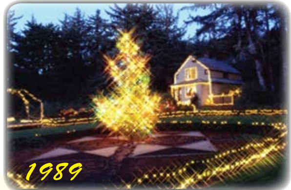
25,000 MINIATURE LIGHTS