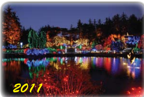
300,000 LIGHTS - MOSTLY L.E.D.