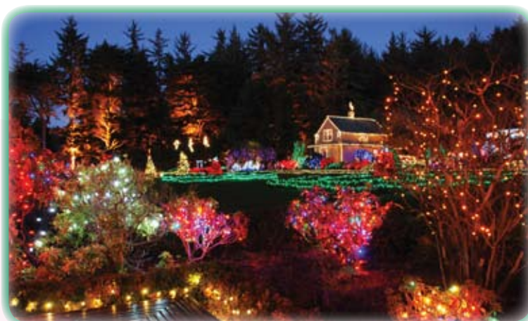
In 2019, one of our favorite views was turned into a 550 Piece Puzzle available in our Information & Gift Center.

Adorable!, Amazing, Astounding, Awesome, Breathtaking, Brilliant, Cool, Dazzling, Epic, Exceptional, Extraordinary