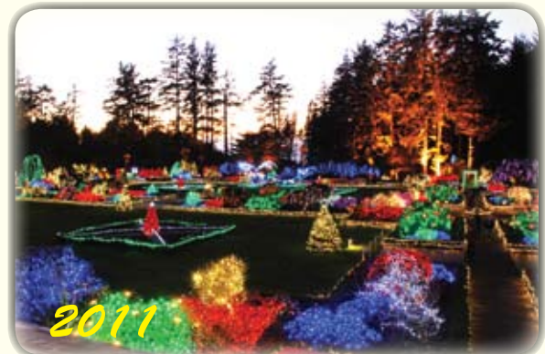
300,000 LIGHTS - MOSTLY L.E.D.