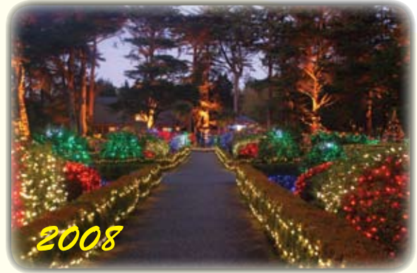
250,000 LIGHTS - MOSTLY L.E.D.