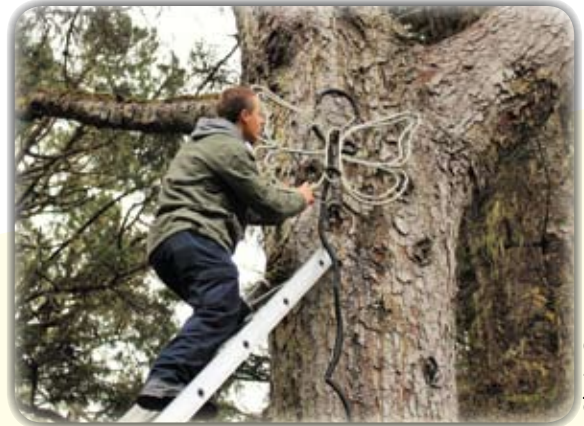
Austin Cybulski - up the ladder? No problem!