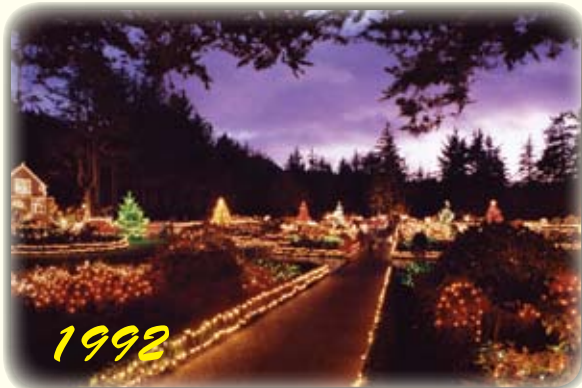
100,000 MINIATURE LIGHTS