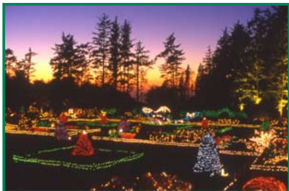
New large landscape lights on westside trees.