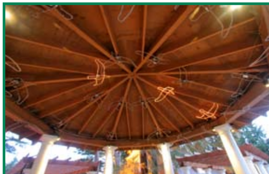
Individually controlled seagulls overhead.

The class decided to design a display with three main elements. The first element, consisting of 28 individually controlled seagulls, would reside under the roof of the main entrance gazebo. By sequentially turning individual birds on or off the birds could be made to appear as if they were flying across the ceiling in up to six different paths. The second element, of 20 red crabs, was placed in the land-scaped area immediately to the left of the main entrance. By sequencing these crabs, it was made to appear that there were four crabs scuttling around in the area. The third and final element was a sequenced line of eight blue and white waves which flowed back and forth around the scurrying crabs. All in all, the class used nearly 1000 feet of variously colored rope lights in the construction of the display. The 40 individual light groups were