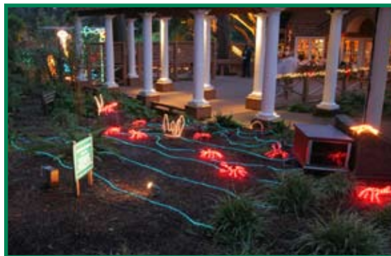
Scurrying crabs and blue and white waves.

It was the students' opportunity to demonstrate how they had mastered the concepts and skills covered in the class. One of the conditions of this exam was that the class instructor would serve only in the roles of consultant and unskilled labor. The project would succeed or fail dependent on the students themselves. The class successfully rose to the occasion and other classes and departments at the college graciously offered their services and expertise and joined what became a multi-departmental design and construction team.