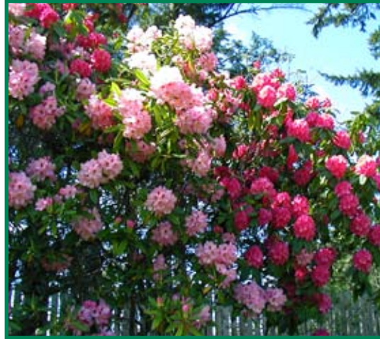
Shore Acres Gardens - Springtime Rhododendrons