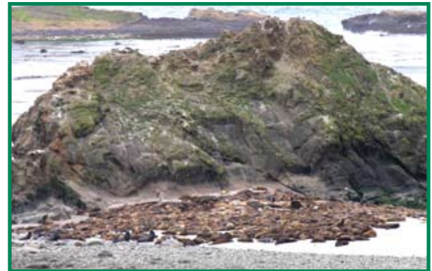
Shell Island at Simpson Reef