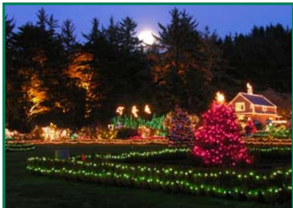
Brilliant L.E.D. lights illuminate large Christmas trees.