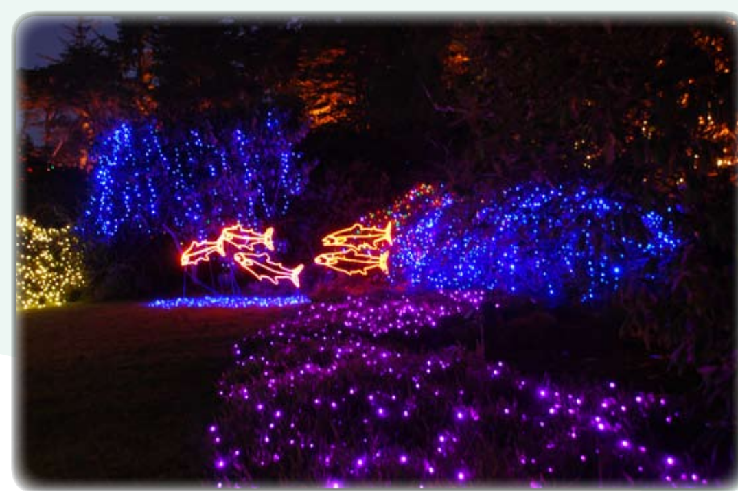
SALMON "SCHOOLING" IN THE GARDEN EAST OF THE POND