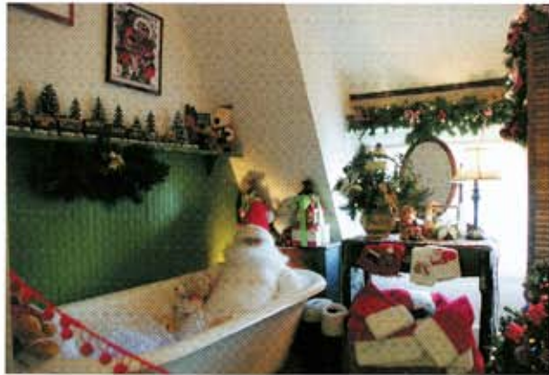
Santa in the bathtub.