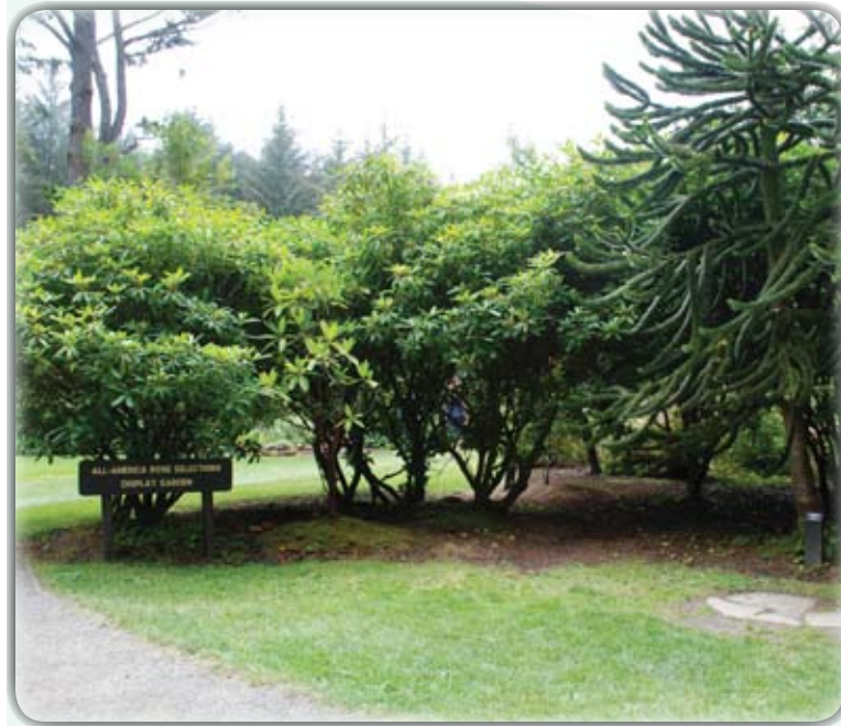
AARS ROSE DISPLAY GARDEN

BY ELLIE KINNEY-MARTIAL, RANGER SUPERVISOR, SHORE ACRES STATE PARK