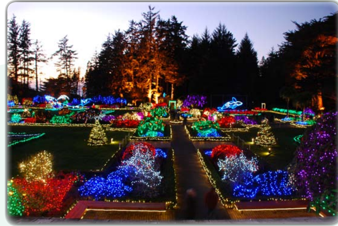
OVERVIEW FROM THE UPSTAIRS WINDOW, SPOUTING WHALE AND LEAPING ORCA