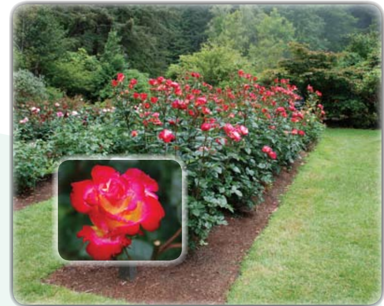
"DICK CLARK" - GRANDIFLORA - AARS 2011

The next time you visit Shore Acres remember to take some time to enjoy this treasured spot: the sights, smells, and sounds that make this such a special place. ■