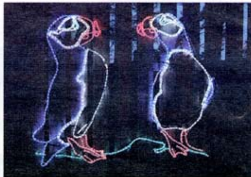
By Benjamin Brayfield, The World

“Pictures at eye level typically aren’t at the best angle.”