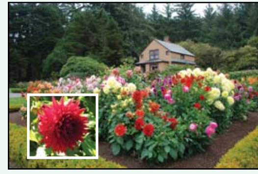
Shore Acres State Park-Dazzling Dahlias