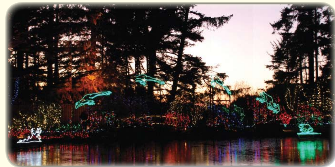
LEAPING FROG DISPLAY DESIGNED BY DON MCMICHAEL

Internationally recognized marine artist, Don McMichael, has worked with us on some of our biggest displays, right from the beginning. Not only designing - but often telling a story. Don designed a life-size gray whale that spouts. Then a life-size Orca, jumping and rolling in a very realistic way, followed by a pair of sea lions, one male the other female, with the male showing off to an unimpressed female. Don has artistically designed 4 pelicans in stages of flight - landing on the garden house chimney, as well as a pair of puffins that occupy space on the southwest fence. Another favorite display is his “Schooling” salmon. When we asked Don to design a frog leaping across the pond, he told us this was a great departure from his usual subjects, but our leaping frog remains one of the all time favorites during the display.