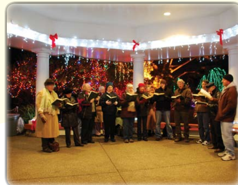
CHOIR FROM THE FIRST PRESBYTERIAN CHURCH, NORTH BEND