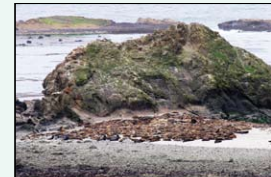
Simpson Reef and Shell Island