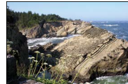
South View from Shore Acres