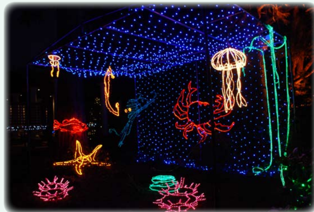
UNDERSEA GARDEN AT THE ENTRANCE