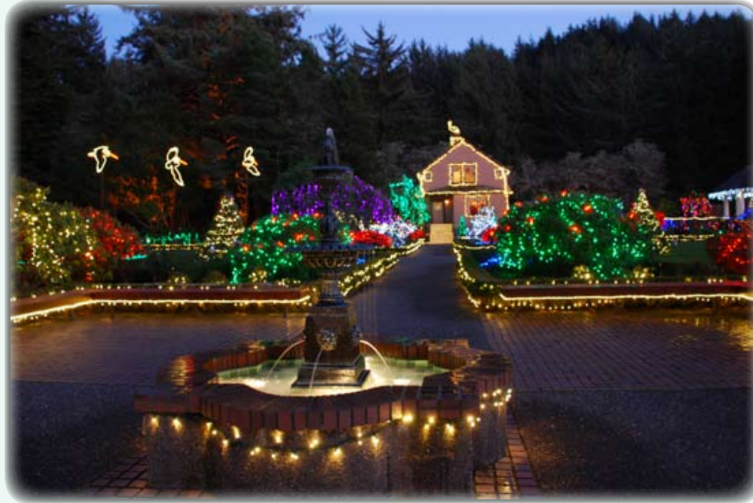
MEMORIAL FOUNTAIN, PELICANS AND GARDEN HOUSE