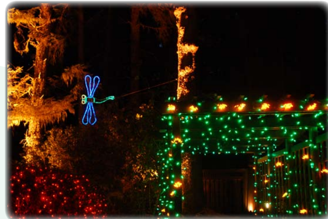
DRAGONFLY NEAR THE PERGOLA COVERED WITH GOLD FLOWER CLUSTERS