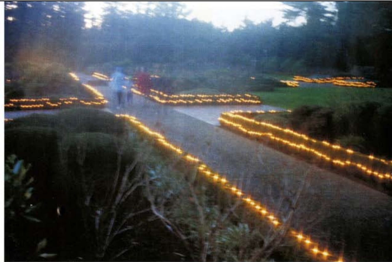
Shore Acres Lights in 1987.

The success of that first display changed everything. "We weren't talking about Butchart Gardens any more," explains David. "Our test run had developed its own show."