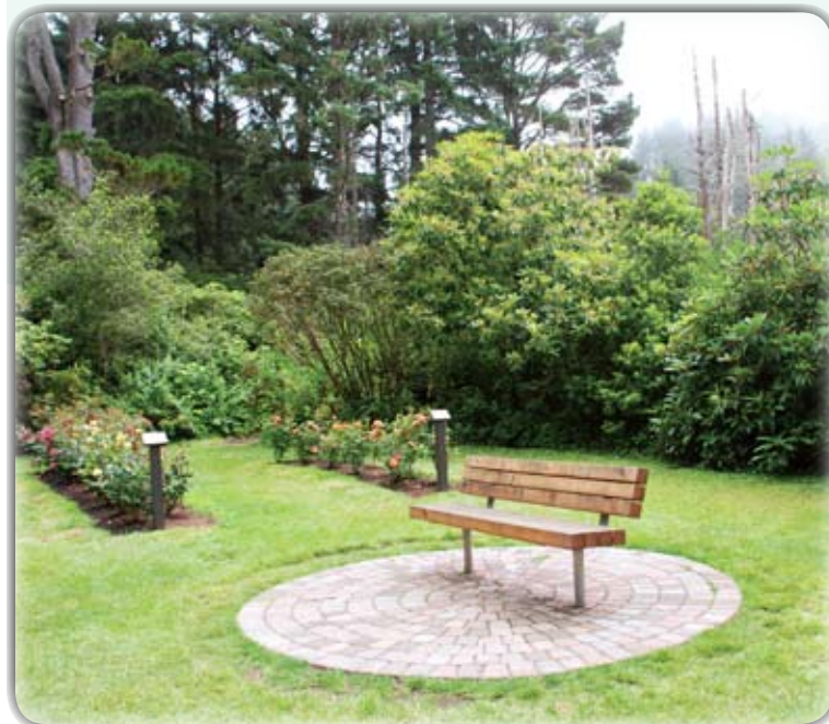
A QUIET PLACE TO STOP AND "SMELL THE ROSES"