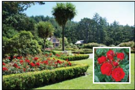
Shore Acres' Gardens Above the Waves