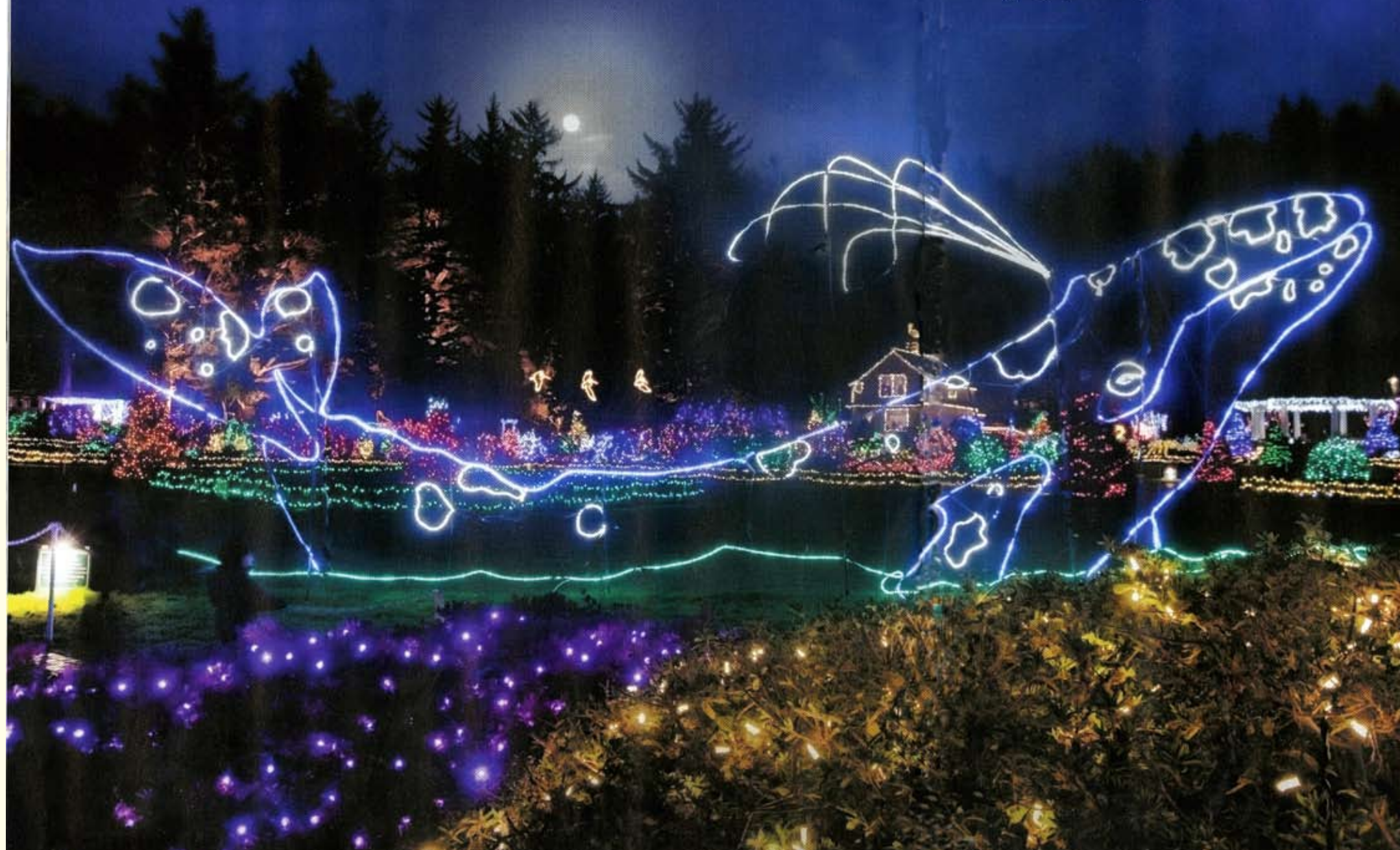
The Gray Whale delights Holiday Visitors at Shore Acres

Thanks to one very dedicated couple and lots of volunteers, the holiday lights at Shore Acres State Park still shine brightly after 25 years.