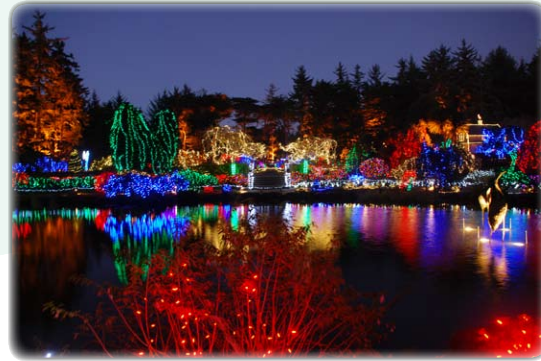
AMAZING REFLECTIONS AT THE 100' LILY POND