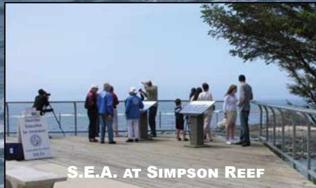
S.E.A. AT SIMPSON REEF