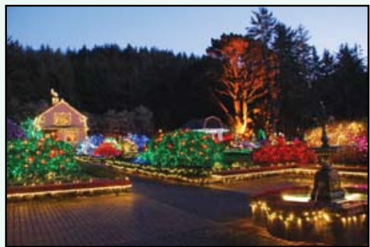
Holiday Lights at Shore Acres State Park