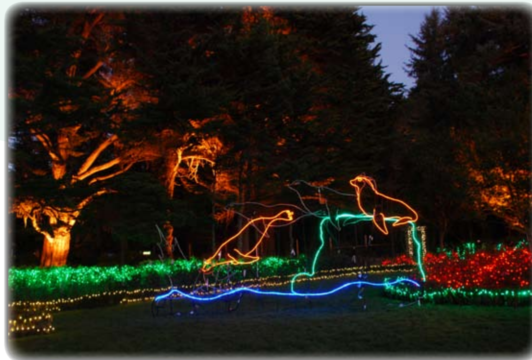
DIVING SEA LIONS