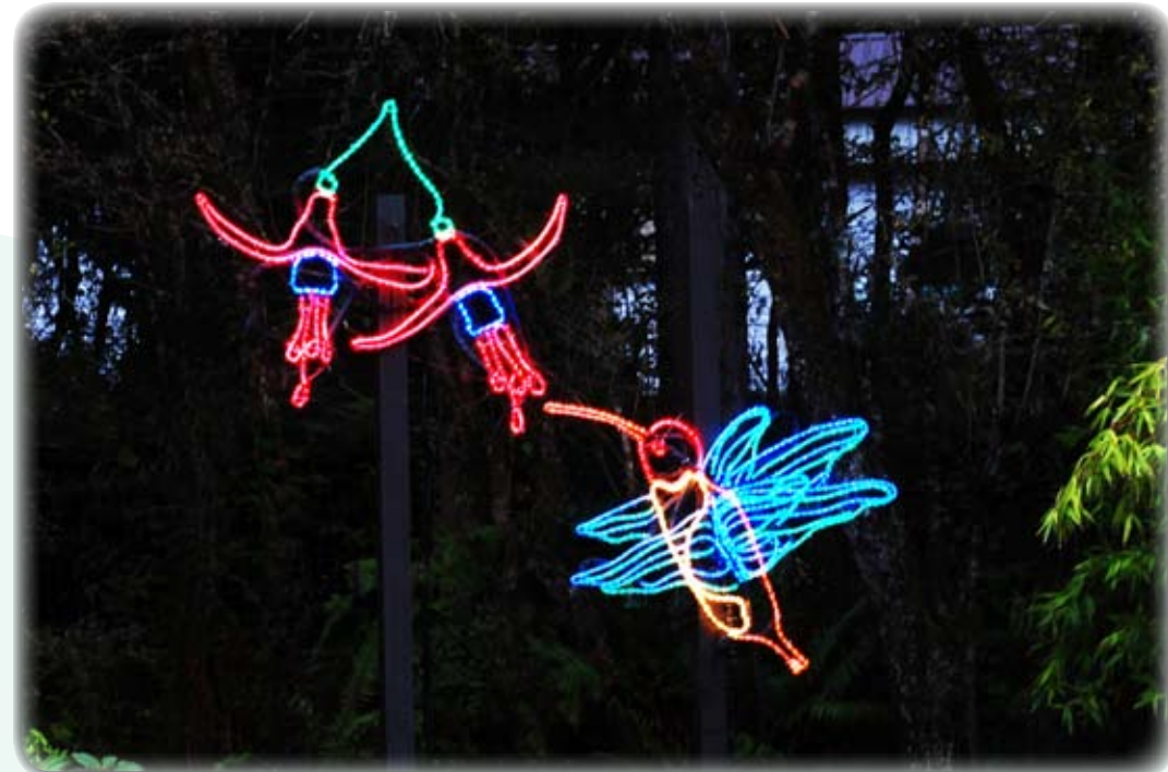
FUCHSIA FLOWERS AND ANIMATED HUMMINGBIRD