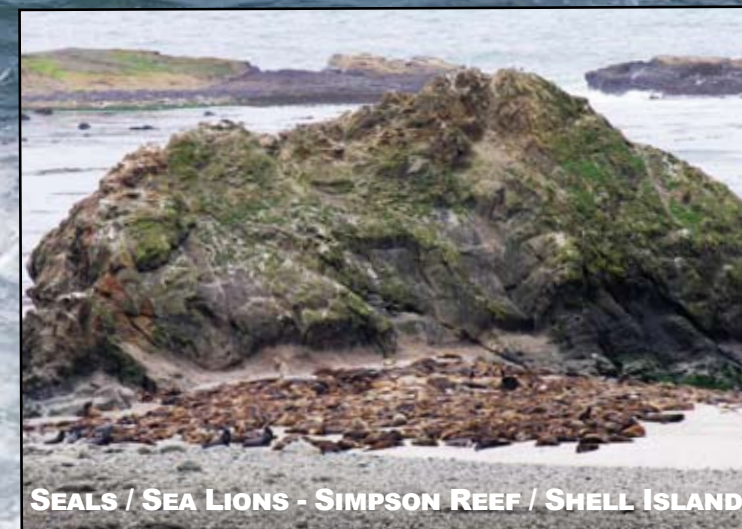
SEALS / SEA LIONS - SIMPSON REEF / SHELL ISLAND

Other opportunities include exploring the Interpretive Center ( the old Friends' Information & Gift Center ) in the campground or visiting Simpson Reef Overlook. During the summer, Shoreline Education for Awareness Volunteers are at Simpson Reef with spotting scopes helping visitors learn more about the diverse wildlife that can be seen along our coast. For more information on any of these interpretive opportunities, please call 541-888-0982. ■