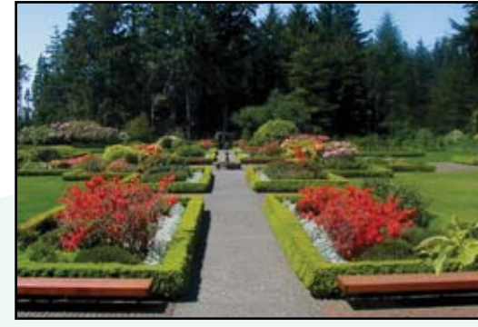
Shore Acres' Gardens Above the Waves