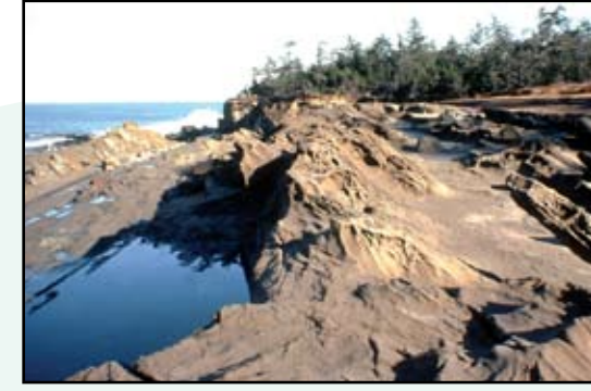
Marine Terrace North of Shore Acres