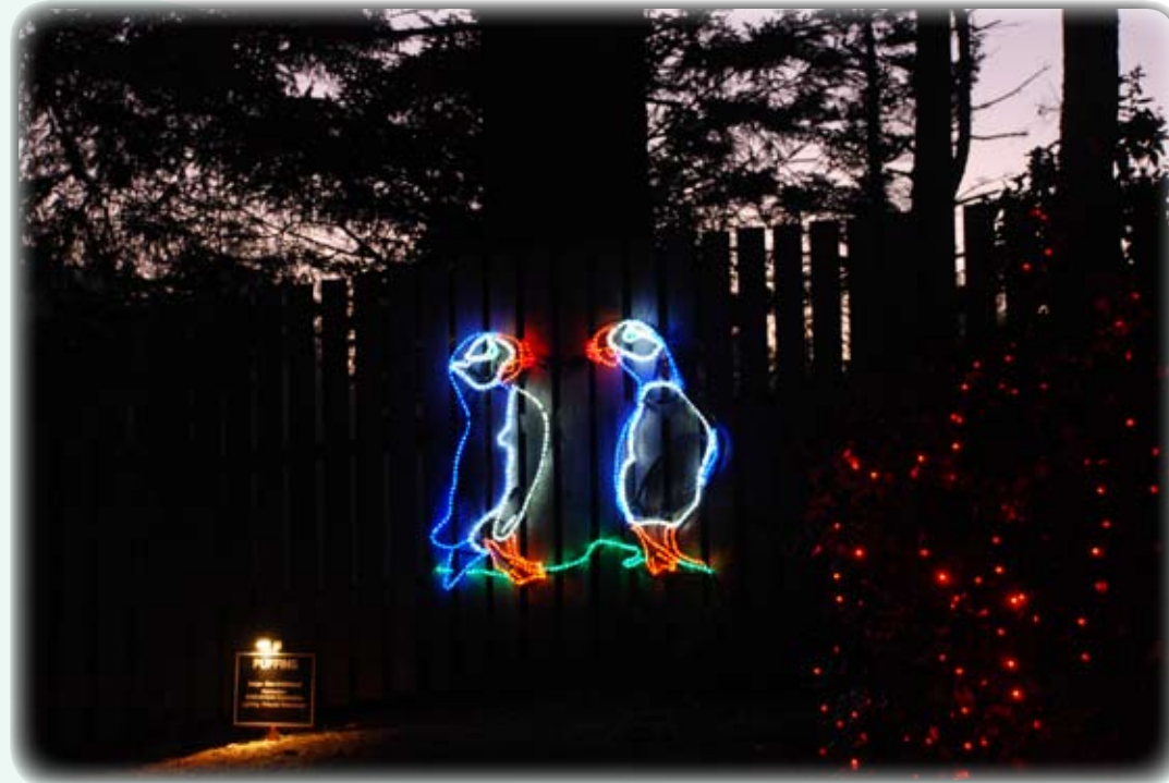
PUFFINS NEAR THE SOUTHWEST CORNER OF THE GARDEN