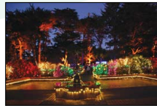
Holiday Lights at Shore Acres State Park