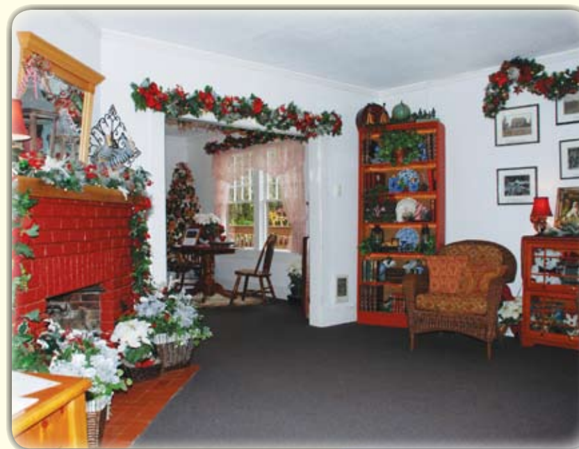
GARDEN HOUSE LIVING ROOM AND DINING ROOM

The 25th annual Holiday Lights at Shore Acres State Park saw an estimated 57,768 visitors as compared to 49,028 last season. Weather is always a factor and Coos Bay-North Bend had less than 2 inches of rain during the lights season as compared to nearly 12 inches the previous season.