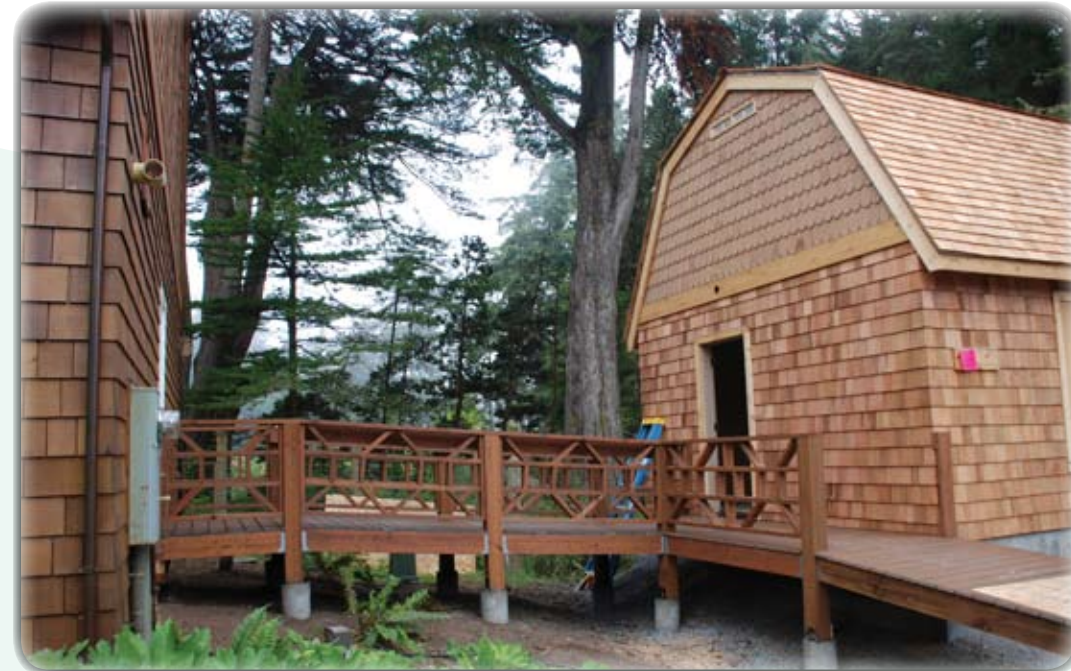
NEW STORAGE FACILITY FOR THE INFORMATION & GIFT CENTER

This is possible only by the ongoing support from our volunteers, visitors, and the success of the Holiday Lights and the Information and Gift Center. ■