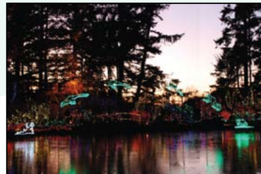
Holiday Lights at Shore Acres State Park