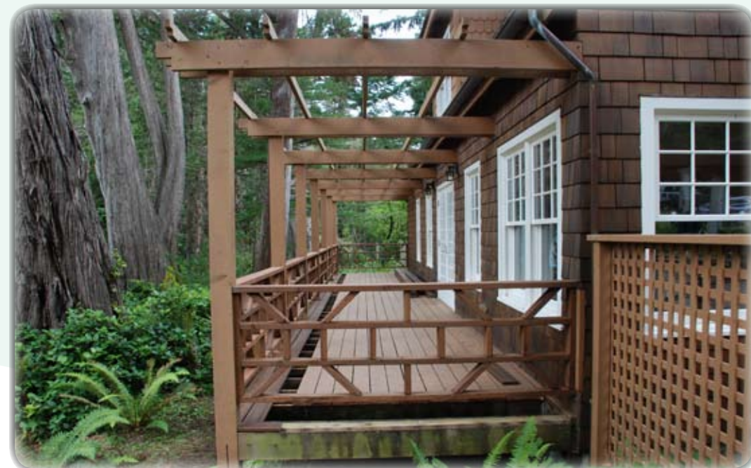
NEW TREX DECKING ON THE SOUTH DECK OF THE IGC