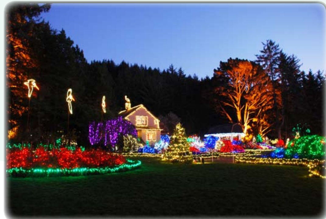
UPLIGHTED GIANT MONTEREY PINES