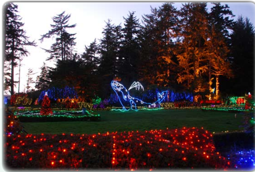
SPOUTING 45' GRAY WHALE NEAR UPLIGHTED GIANT EVERGREENS