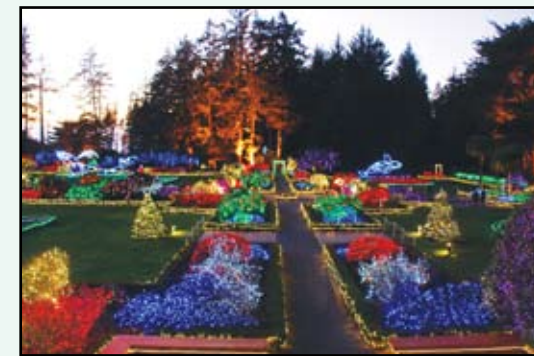
Holiday Lights at Shore Acres State Park