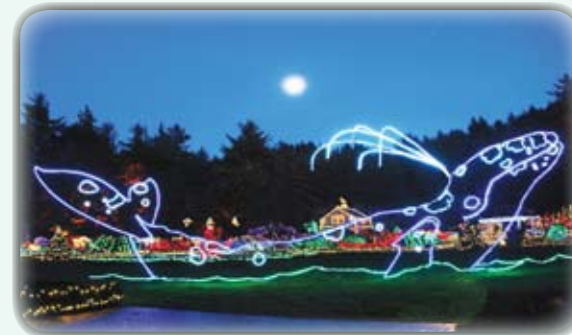
LIFE-SIZE (45') GRAY WHALE DESIGNED BY DON MCMICHAEL