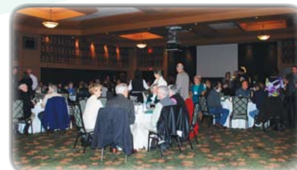
The Mill Casino Hotel did a great job on the buffet dinner that featured Sirloin Roast Au Jus, Breast of Chicken Florentine and Cheesecake topped with the FoSA Logo.