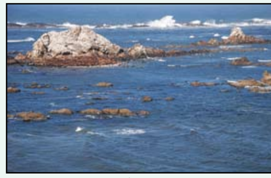
Simpson Reef and Shell Island