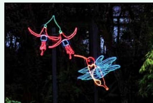
Holiday Lights at Shore Acres State Park