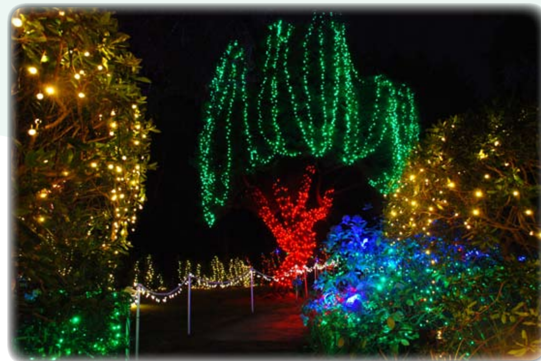
HUGE CRYPTOMERIA TREE IN THE SOUTHEAST GARDEN