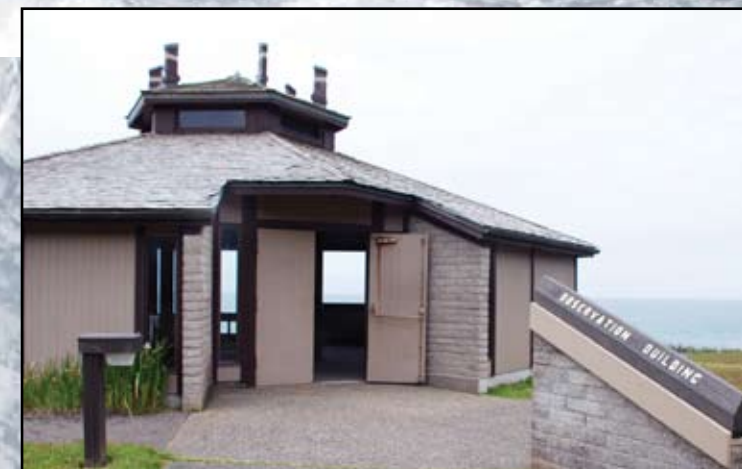
COMING THIS FALL - NEW INTERPRETIVE PANELS IN THE OBSERVATION BUILDING AT SHORE ACRES