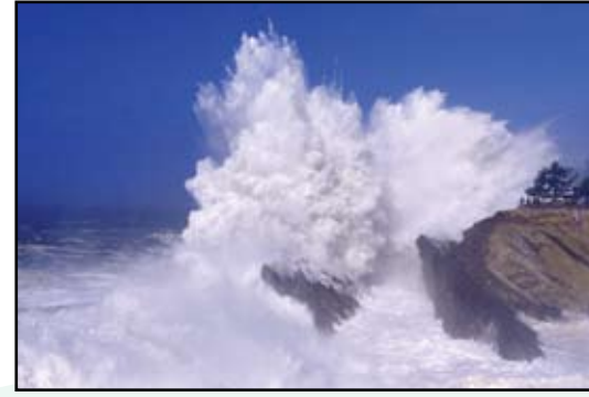
Shore Acres "Wave"