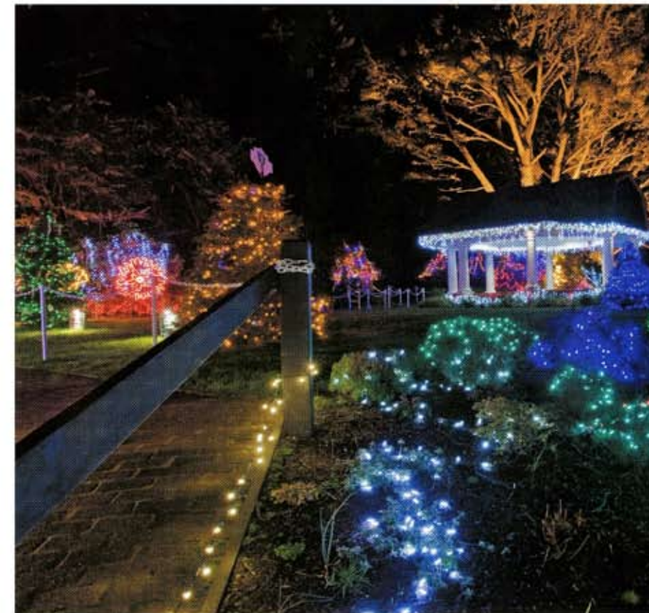
Shore Acres today.

From the beginning, the Friends of Shore Acres invited the Bay Area communities (Coos Bay, North Bend, and