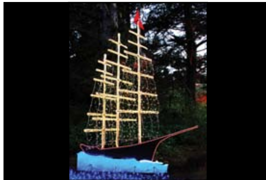
Holiday Lights at Shore Acres State Park

POSTCARDS DESIGNED BY SHIRLEY BRIDGHAM; PRODUCED BY WEGFERDS' PRINTING & PUBLISHING, NORTH BEND