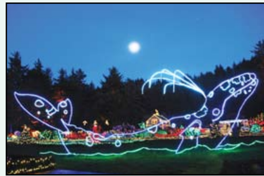
Holiday Lights at Shore Acres State Park