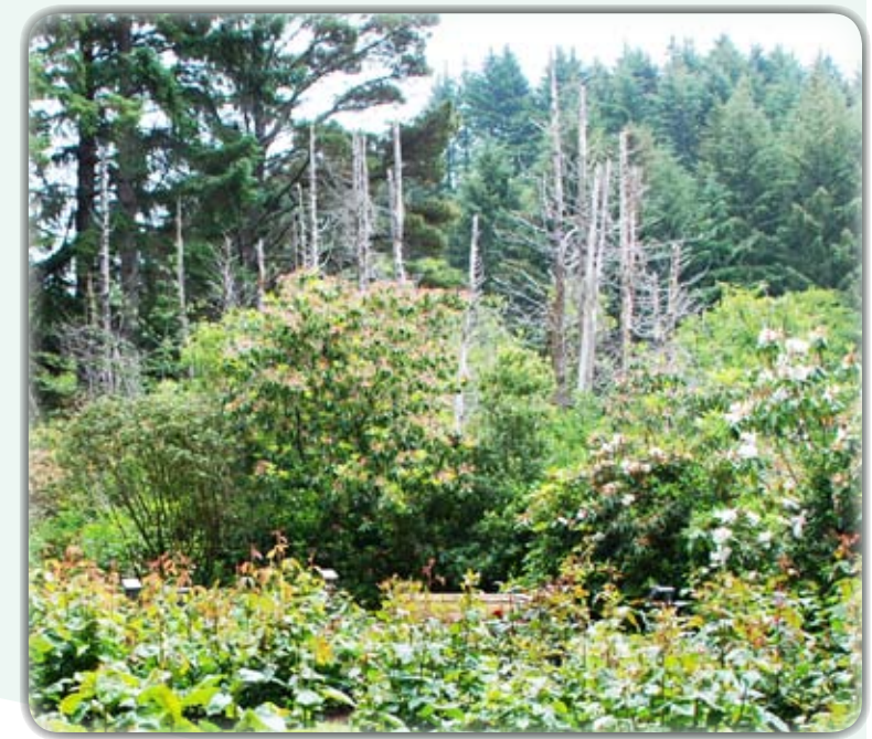
SNAGS, AKA DEAD TREES, VALUABLE TO WILDLIFE