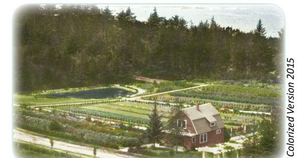
Garden House (former Gardener's Cottage) - early 1900s - Note the half-moon shape of the first pond which Simpson would modify to present shape, circa 1914