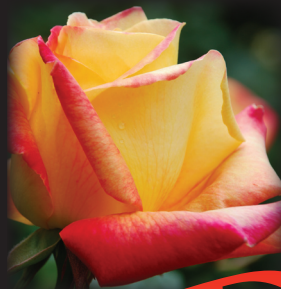
Love & Peace